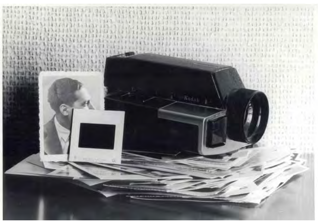
Baders Camera, Silver gelatin fibre print, 25x35cm, 2012.

ordinary people that are truly extraordinary in that they cannot be replaced. In 2013, the complete series was acquired by the British Museum. The same year, she drew attention to the misrepresentation of women by Saudi Arabian media. In "The State of Disappearance" she interrupts an actual news image of a woman by layering it with words. These interruptions evoke an association between the word (love, courage, happiness and intelligence) and the veiled women, therefore, humanizing a generic image and emphasizing the act of preservation in the presence of social bias. Again, a photograph entitled Courage from the series was acquired by the Los Angeles Contemporary Museum of Art.