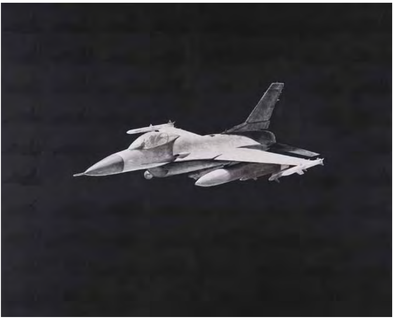
Thaier Helal Untitled, from the Made in Syria series, (2012), 170 X 170 cm. Mixed media on canvas, Image copyright the artist. Courtesy of Ayyam Gallery.

moved towards pure abstraction after relocating to the United Arab Emirates. His interests shifted when he settled in Sharjah and worked as a designer and illustrator, as he felt distant from nature, the initial stimulus of his imagination. Embarking on a series of trials, he experimented with various approaches, destroying many of the results along the way.