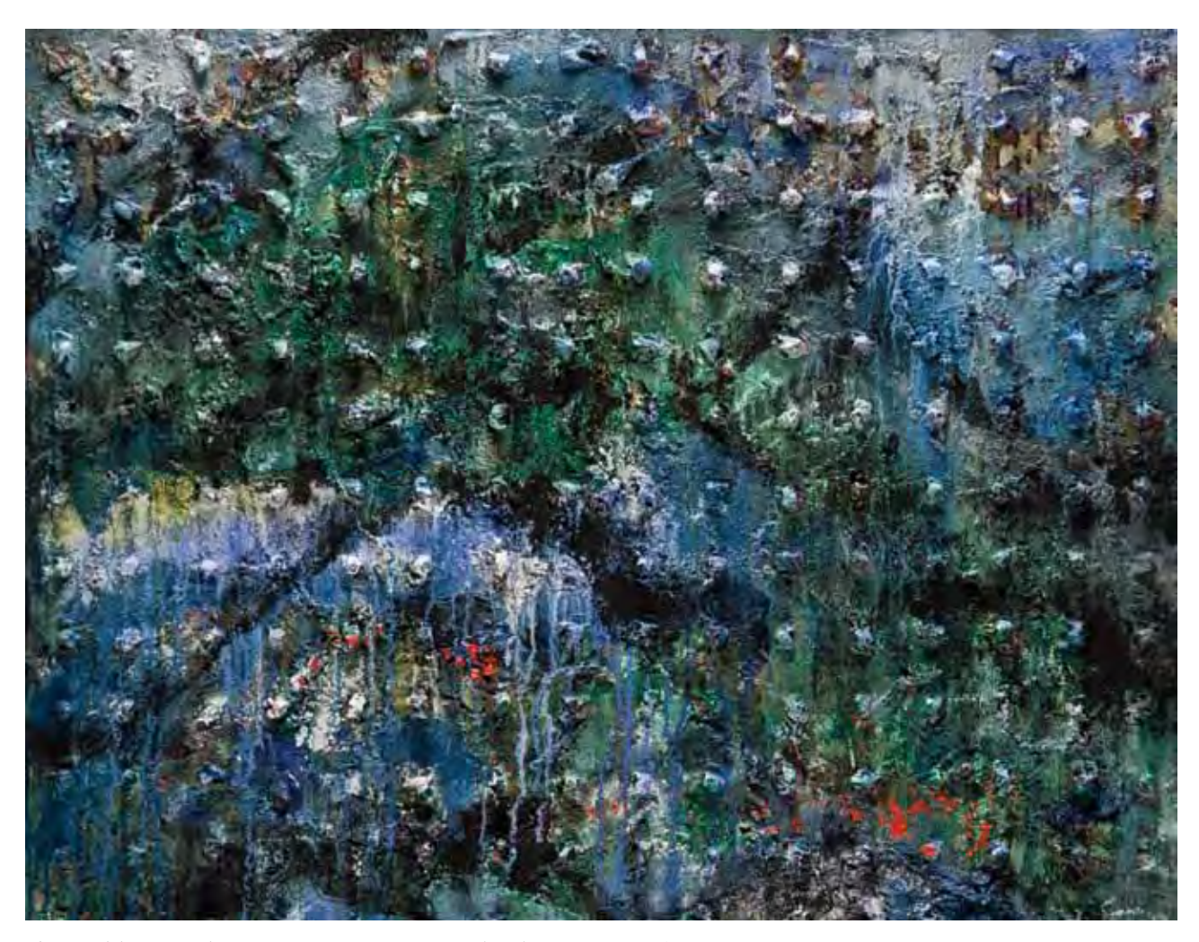
Thaier Helal, Sprin in the Mountain, 120 X 120 cm, Mixed Media on Canvas, 2014.

aesthetic possibilities of emphatic brushwork, he began to employ form to denote what cannot be experienced by touch. Helal returned to the image of a bird in flight in the mid 2000s, and portrayed the animal as though comprehended with different methods of perception. In paintings that show the creature in vertical takeoff, for example, colour fields appear to vibrate behind roused silhouettes as brisk brushstrokes cut through uniform spaces, signifying sonic impressions. Square lattices are painted over a number of works, enclosing the recurring creature. Mirroring the artist's previous paintings, the restricted spatial depth of these compositions directs the viewer to the thrust of the bird and its multicoloured contours. As Clement Greenberg observed in the seascapes of Gustave Courbet, the use of such relatively