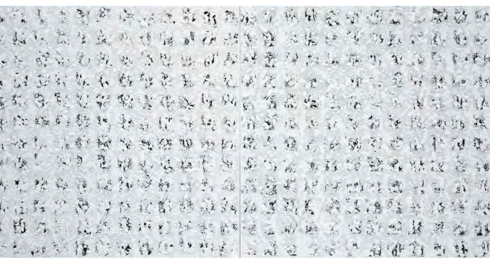
Thaier Helal, Snow and Trees, 2008, 90 X 180 cm, Mixed media on canvas,

In Thaier Helal's recent series, impastoed canvases serve as multi-sensory explorations of Syria's terrain, allowing the artist to figuratively reenter the now war-torn country. Textured strata, gestural brushwork, and earth-tone colour schemes meet in abstracted fields of media that resemble the surfaces of natural environments as resultant patterns delineate organic movement and growth. Created as two distinct bodies of work, Helal's latest paintings are rendered from memory and indicate a return to abstraction after several years of experimentation with appropriated imagery and found objects.