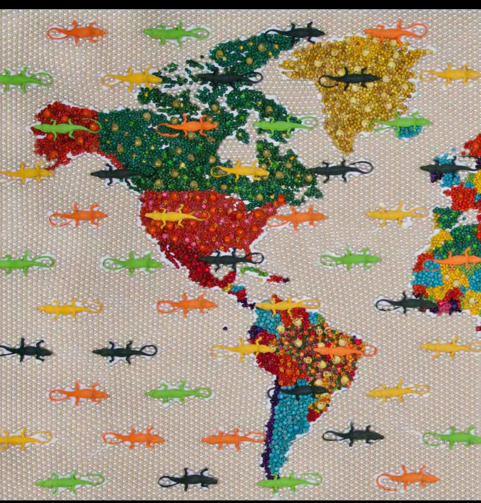
Thaier Helal, Political Map of the World, 2014, 170 X 340 cm. Mixed Media, including beads and toys, on canvas, Image copyright the artist. Courtesy of Ayyam Gallery.