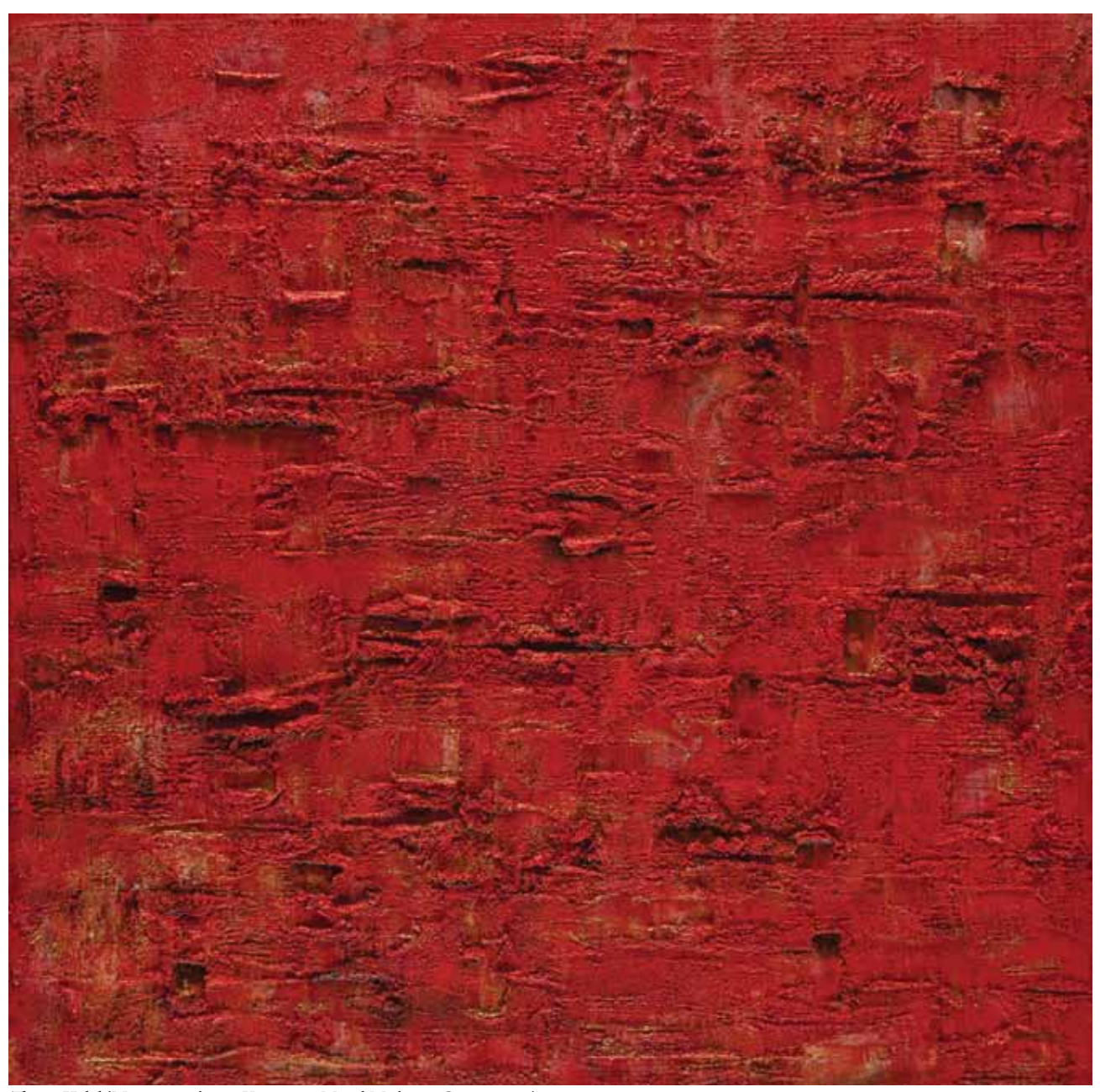
Thaier Helal 'Mountain 2', 170 X 170 cm, Mixed Media on Canvas, 2014.

space that would come to define his compositions. In an untitled 1997 acrylic on canvas painting, squarely placed images of a brown and black bird chart alternating actions. Situated against shallow spatial depth and without reference to traditional perspective, the abstract figures are shown flying, landing, and perching, collectively representing the process of flight.