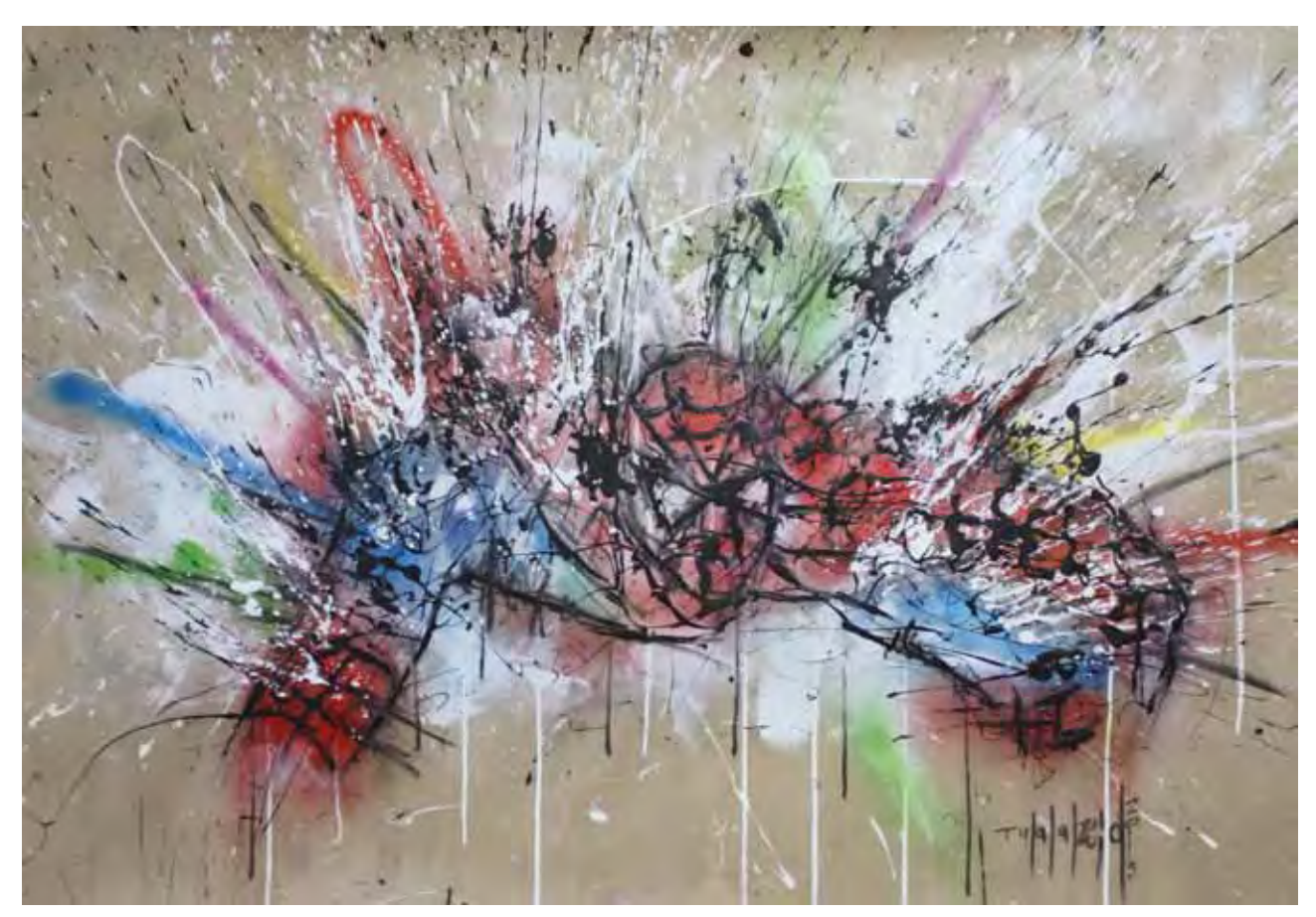
Talal Al Zeid, Spiderman, 2013, mixed media on paper, 110x150cm.

the degree of interest that the artists show in what is going on around them. Do they really want to meet fellow artists from Switzerland and visit their studios? How keen are the artists on getting together with collectors? How interested are they in extending their knowledge and discovering new things through such activities as visiting museums and attending exhibitions?" explains the program director. "We are constantly urging our artists to make the most of their time in the residence, to learn as much as they can, to open their eyes and see things anew. But we do not put undue pressure on them. Ultimately, they can choose to do what they like."