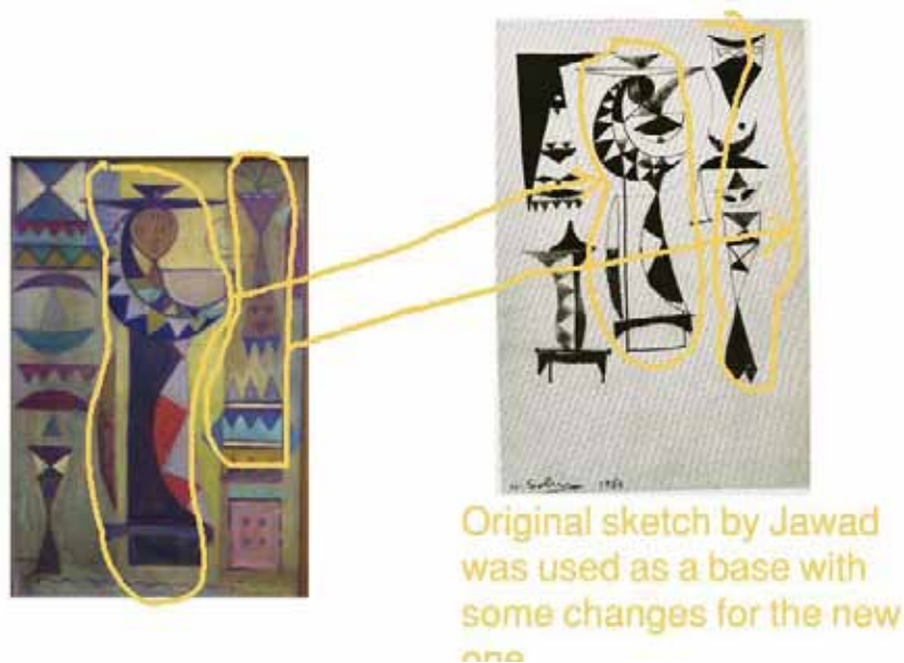
Original sketch by Jawad was used as a base with some changes for the new one