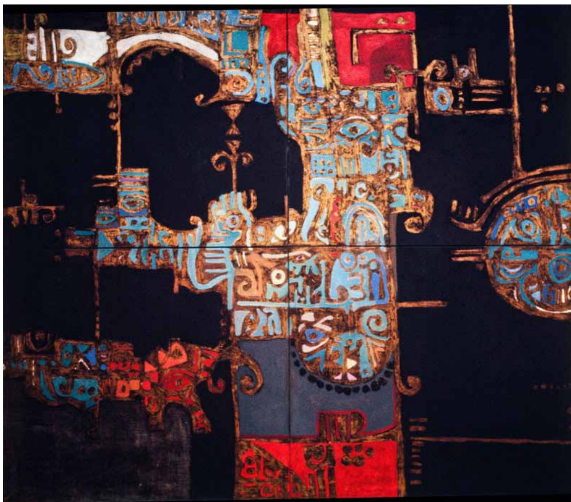
Dia Al Azzawi (Iraq, 1939)

The Lost City , oil on canvas, signed on the reverse, 160 x 160 cm.