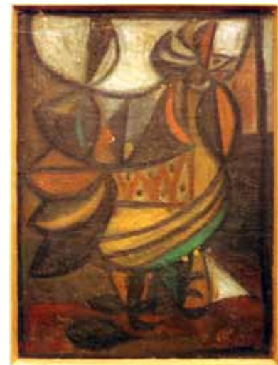
Shaker Hassan Al-Said (Iraq, 1925-2004) Cockerel, oil on canvas on board, signed in Arabic lower left, 46.5 x 33.3cm are still listed on Interpol as stolen. Country of event: Iraq Place of event: BAGHDAD Date of event: March 2003 IPSG reference: 2004/56300-1.35 NCB reference: Theft Saddam Art Centre

GCC or to London, Paris and New York. The same was said in Germany at the end of the Second World War. Looking at Germany as a case study, it is evident that its culture was essential to the rebuilding of the nation, the same should be with Iraq. However the dynamic in Iraq is different from what happened in Germany. Yes both countries were nearly destroyed and ransacked of its treasures but in Germany there was very little looting by the nationals of the country. In the case of Iraq, the theft was by the Iraqi people, with Germany it was the Soviets on a national scale with complete collections removed and sent to Moscow, such as 'Priam's Treasure' which was stolen from Berlin and housed at the Pushkin Museum. The real issue here in the region is when a work is on offer, few people actually bother to check it against what is listed publicly as stolen by Interpol, and when it comes to modern Iraqi art to The Red List. Two works by Shaker Hassan were listed on Interpol as stolen from the museum in Baghdad, they were offered for sale at auctions in Dubai by two separate institutions, one was sold, the other could not find a buyer. These works