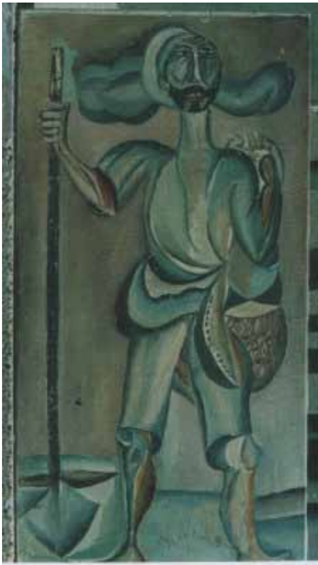
Shaker Hassan Al-Said (Iraq, 1925-2004) , The Farmer , oil on canvas, signed in Arabic lower left, 100 x 48.5cm

Type of event: Theft Country of event: Iraq Place of event: BAGHDAD Date of event: March 2003 IPSG reference: 2004/56300-1.34 NCB reference: Theft Saddam Art Centre Type of event: Theft