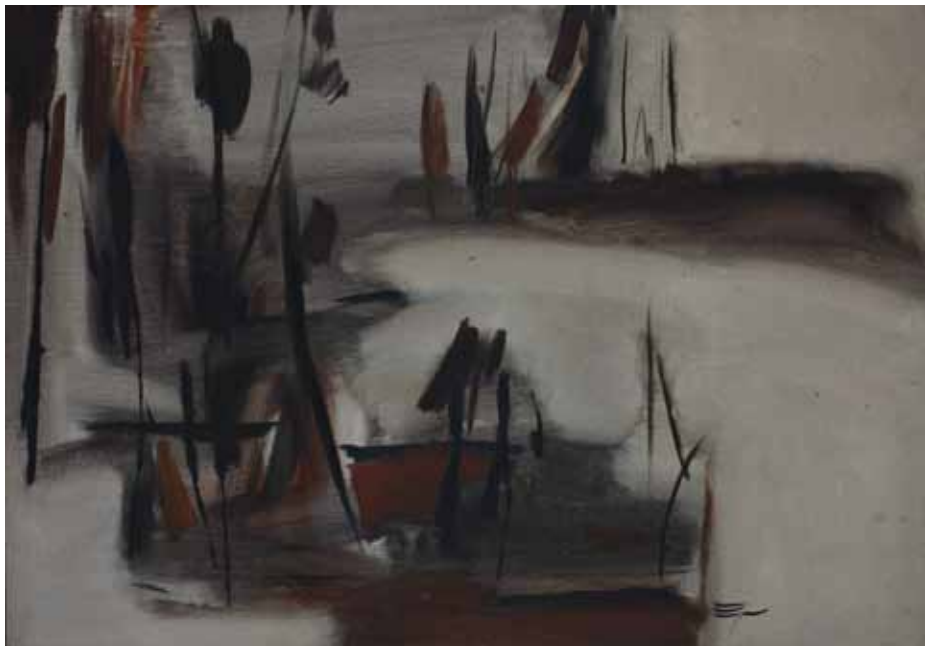
Sohrab Sepehri, (Iranian, 1928–1980) The Glade, oil on canvas, signed in Farsi lower right, 69 x 100cm.