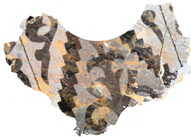
Untitled 3 , 38 days of re-location, 2014, black & white photo emulsion on paint fragments collected from Jerusalem's old city, 27.5x21.5cm.

person under Israeli occupation. I asked myself what was stopping me from feeling free? It was the system itself which had forced upon me the belief that obtaining freedom was only possible through predetermined systems and mechanisms that would always be beyond my control. As if there was a 'freedom council' which would determine who should be granted freedom and who should not. I understood that I needed to break free from the system and once I did, I freed myself. I was able to do this because of my research on the origin and function of images.