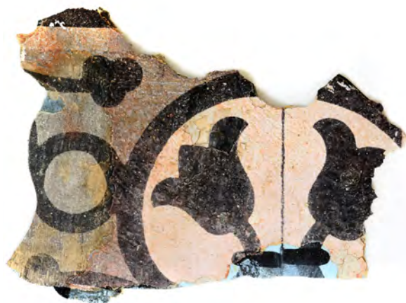
Untitled 2 , 38 days of re-location, 2014, black & white photo emulsion on paint fragments collected from Jerusalem's old city, 20x15.5cm. Courtesy of the artist