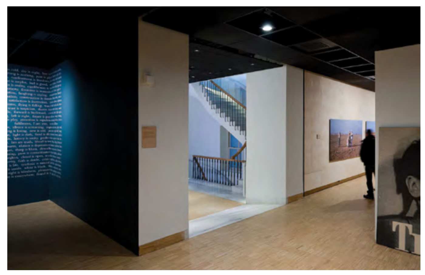
SALT Beyoglu Exhibition hall.

In the back ground of Salt Research lies Platform Garanti Contemporary Art Center, which was founded in 2001 by Vasif Kortun with support of Garanti Bank and soon with inclusion of the Ottoman Bank in its funders, once the latter was acquired by the former.