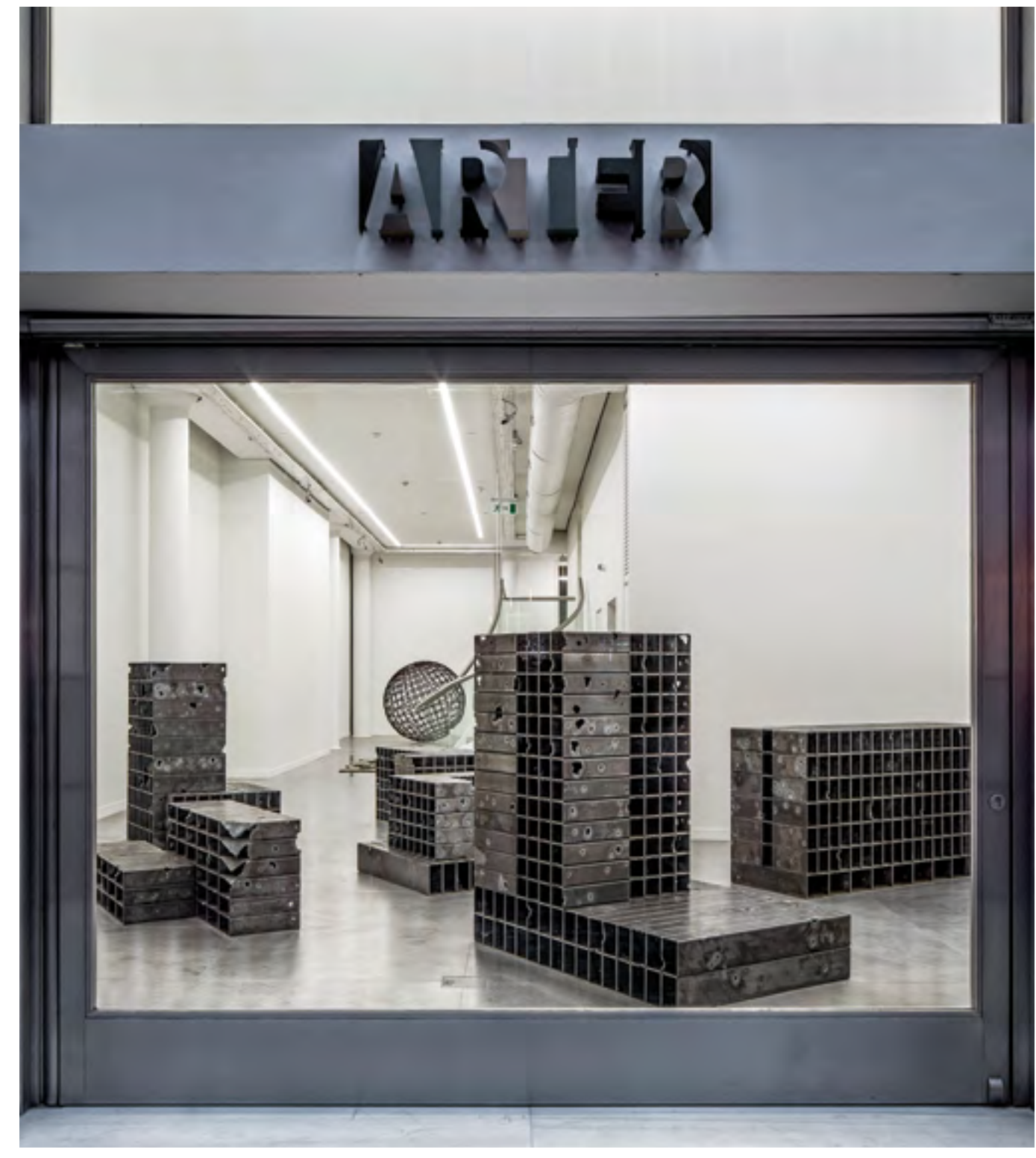
Depo, ARTER - space for art, Istanbul, outside view from the exhibition "You Are Still Here" by Mona Hatoum, 2012.