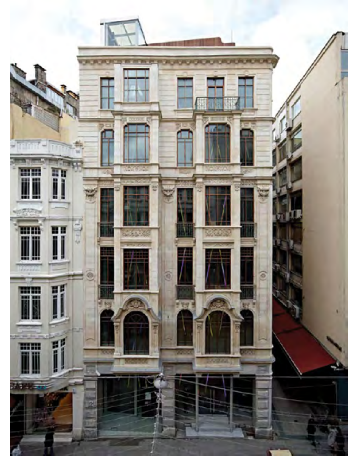
Front view of Borusan Music House.