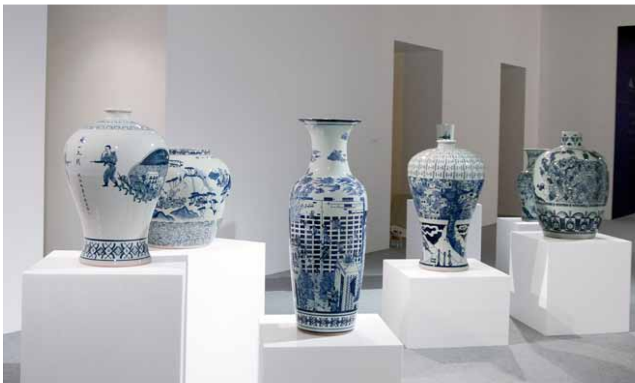
Raed Yassin, China, 2012, 7 Porcelain Vases

Amsterdam following a 2-year residency, Home Works 5 , Beirut (2010) and Photo Cairo 4 (2008). Yassin was awarded the Fidus Prize for The Best of Sammy Clark at Beirut Art Center's 'Exposureexhibition' (2009), the AFAC grant for production (2010), the YATF grant for production (2008) and the Cultural Resource grant for production (2008). Yassin is one of the organizers of IRTIJAL Festival, has released 10 music albums and founded production company Annihaya in 2009. He is also a founding member of Atfal Ahdath a Beirut based art collective. He currently lives and works in Beirut.