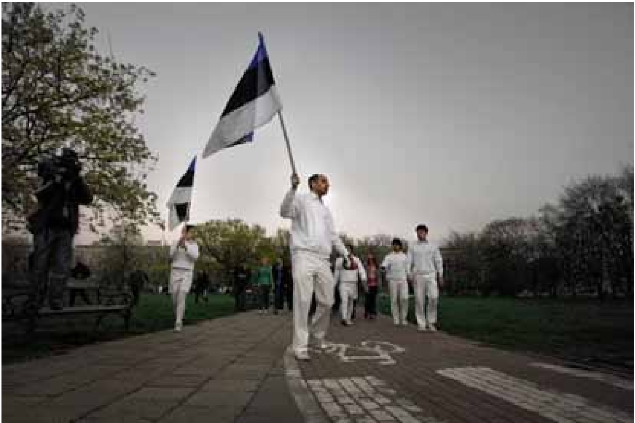
Public Movement, 'Wiosna W Warszawie' (Spring in Warsaw)

in order to raise social awareness. In April 2009, for example, the group of artists organised a public march called 'Wiosna W Warszawie' (Spring in Warsaw) in Tel Aviv, which encouraged the public to walk with them along the memorial path while small ceremonies and artistic actions created by the artists were also taking place during the walk. The march was not to criticise the past, but to motivate 'love and high hopes', create social harmonies and peace, in order to commemorate those in the past who fought for human dignity and survival. 'Performing Politics for Germany' was also one of the practices by Public Movement. The artists believe 'the purest arena of politics is the street' and hence the majority of demonstrations/performances interact with the public on the streets. Public Movement constructs non-violent protests by introducing the ideology of contemporary aestheticism. The nature of such performative movements is to encourage social interactions and public participations through different