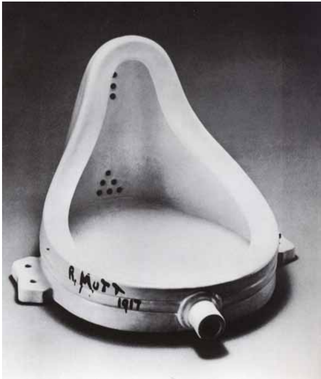
Marcel Duchamp , Fountain (1917)

at, if not appreciating, contemporary art is to approach the subject with an open mind – the mind to adapt and accept the fact that ‘we’ are the driving force behind such forms and mediums.