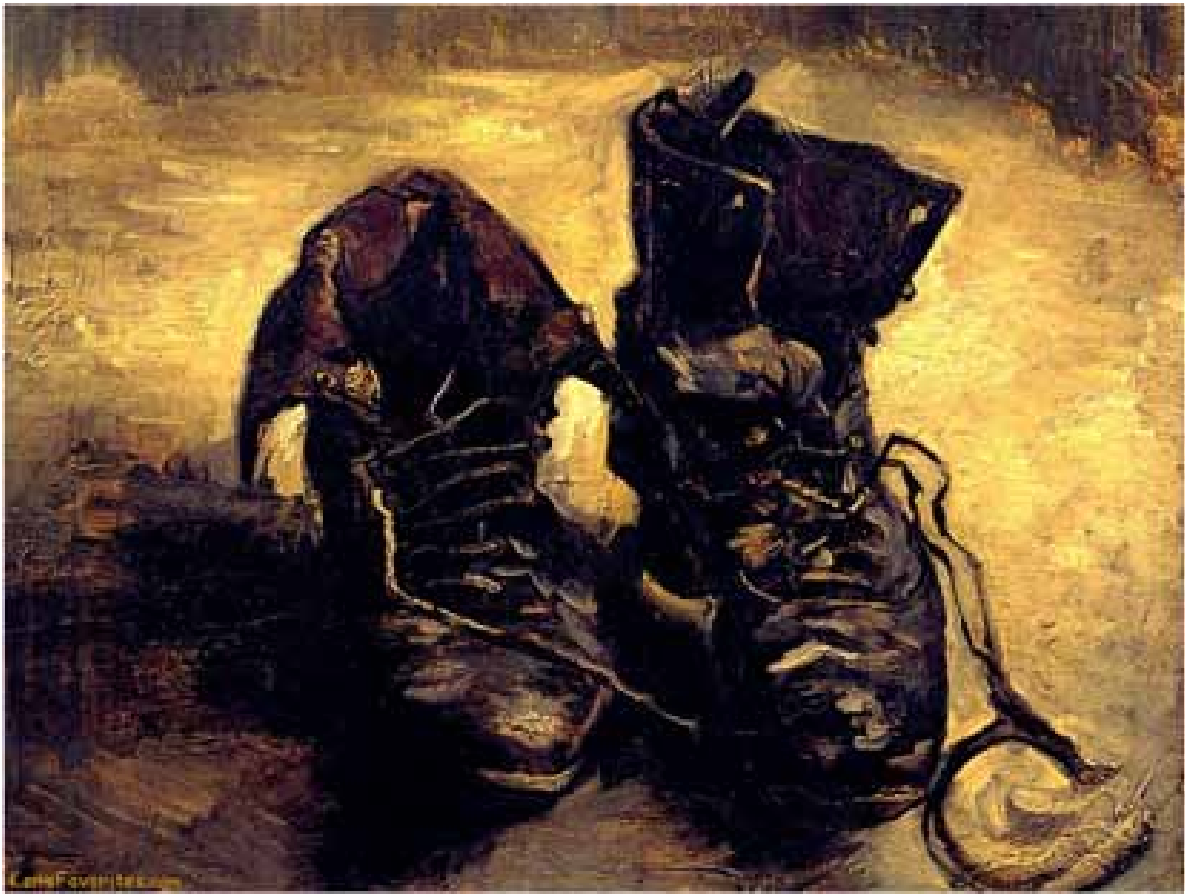
Vincent van Gogh, A Pair of Shoes , 1885

working class. After a number of influential movements and revolutions, those who were fairly active during the period of modern art once again challenged the definition of art. Marcel Duchamp shifted away from his cubist paintings and created one of the very first ready-made artworks – Fountain (1917), a repurposed male urinal. These objects, which were once upon a time considered ‘junk’ became the works of art inside gallery exhibitions. The boundary was broken through; contemporary art was then truly coined when the classification of art was broadened from art for art’s sake to anything and everything.