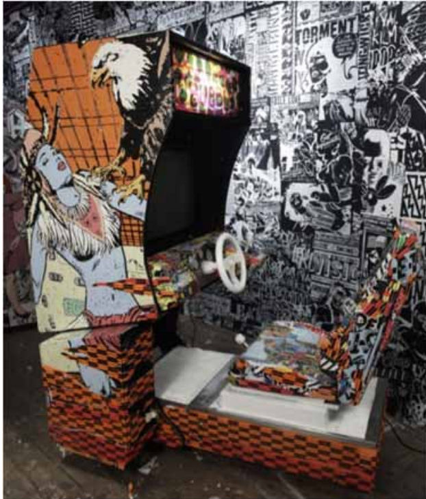
Faile and Bast, Live, Nasty, 1-ON-1 , 2010

At the end of 2011, the image of Carsten Höller's Giant Psycho Tank (1999) was all over the news, Facebook, Twitter, Tumblr and a number of other social networks, due to the artist's recent exhibition, Experience , at the New Museum in New York. The work was an image of a man floating on the surface of a constructed pool inside the gallery space. The Huffington Post described the Giant Psycho Tank as 'a sensory deprivation pool of heavily salinated, skin temperature water', in which a psychological sensation, a so-called 'out-of-body experience', was given to those who had floated weightlessly in this massive tank. This image was certainly a recall of Höller's Mirrored Carousel – the carousel-like swinging machine; as well as Untitled (Slide) – a two-storey high slide, most famously installed in the Turbine Hall of London's Tate Modern.