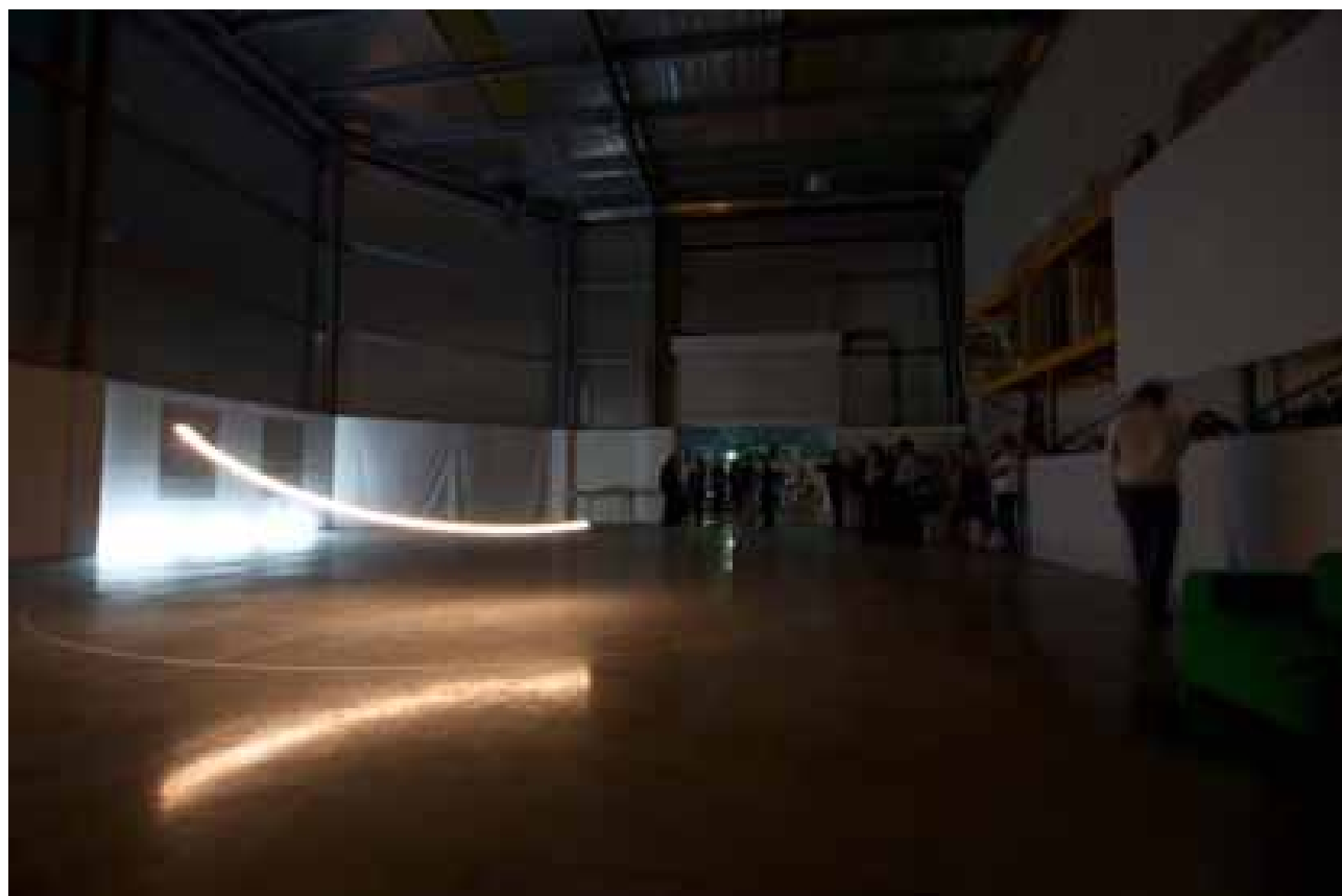
Satellite Broadcast Series: James Clar

and interactive structures in social art appear more and more often in today's contemporary practices because of the effective voice that it evokes and the simplicity of its connection with the audience. Experimental approaches may receive a greater educational response than many institutions have been, and are still, aiming for. This approach popularised the conceptual and abstract representations that the 'static' works of art achieve. Understanding can therefore be exchanged both ways, between the 'work' and the 'audience.' Thus the audience is no longer only a 'viewer,' but also a 'participant'. 'Experimental art performances use visual, embodied, collective, durational, and spatial systems, but the critical sense of their innovation will differ depending on what medium they understand themselves to be disrupting', says Shannon Jackson, the director of the Arts Research Centre at the University of California in the United States. The aesthetics of contemporary art therefore include what Jackson called