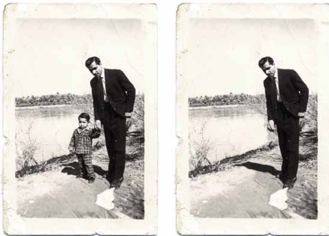
Nedim Kufi, Absence (2010) , Photographic print on canvas, 180 x 240 cm (180 x 120 cm each), Barjeel Art Foundation