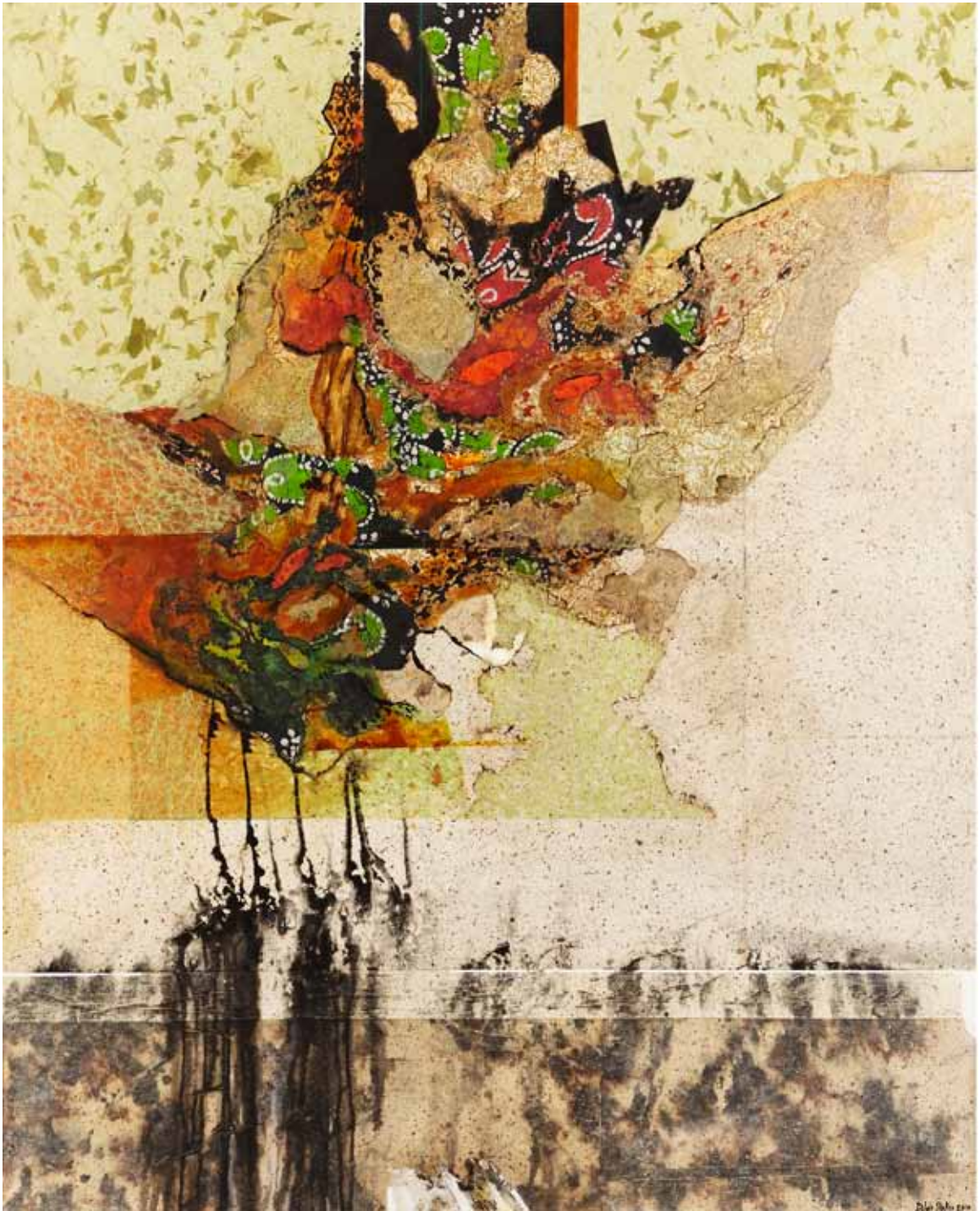
Delair Shaker, Wings of Hope (2010), mixed media on canvas, 152 x 122 cm