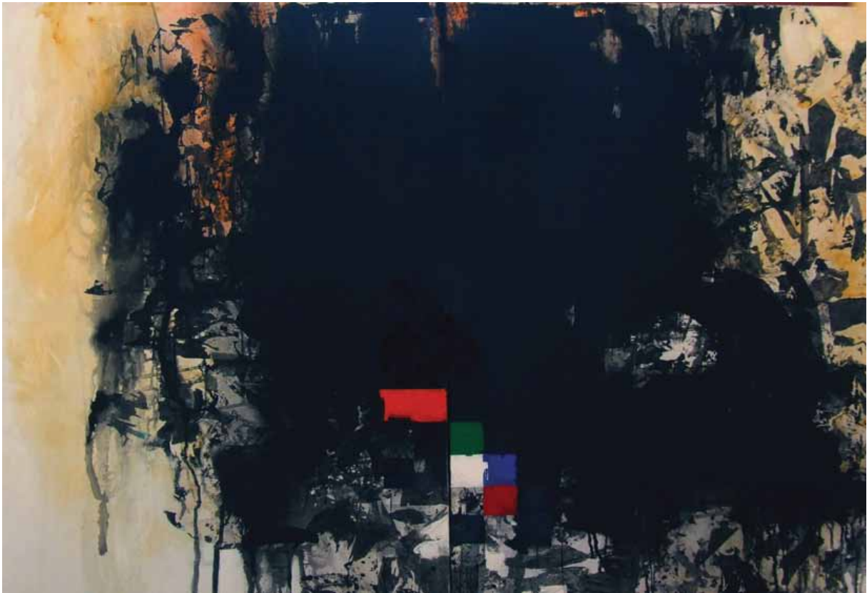
Ghassan Ghaib, Organised Anarchy (2010) , mixed media on canvas, 180 x 360 cm, Barjeel Art Foudation