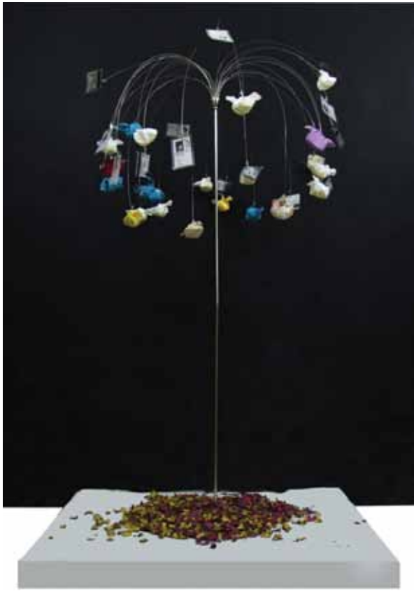
Ghassan Ghaib, The Tree of Memories (2010), Nickel with mixed media, 165 x 80 cm .

Tigris 'from a space of beautiful memories to an arena stained with sectarian conflict and policy.' Yahya, now settled in Houston, graduated from the Academy of Fine Arts with a degree in painting in 1987. Having grown up in Baghdad, he recalls: I was born near this river [the Tigris] and watched its rapidly flowing water carrying boats, wandering between Karkh and Rasafa every day in the placid, peaceful life of the people of Baghdad. This transports me from what I know of it now: it is a river that conceals anonymous victims, feeding the fish in its waters. In Love Dijla 1 , muted tones underscore the plaintiveness of the subject. Particularly disturbing is the inclusion of the corpse, which is covered with a paisley pattern. This print, which the artist has used in previous works, is a popular textile pattern found on the headscarf of Middle Eastern women. 11 Here, Yahya's incorporation of this pattern has