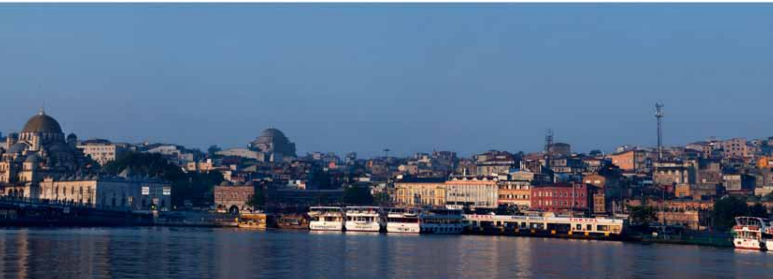
Hamra Abbas , Cityscapes Istanbul, archival pigment prints, 50 by 230 cm, 2010