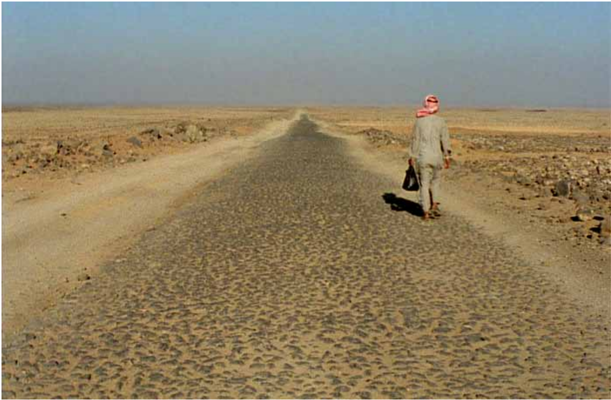
Jananne Al-Ani - The Guide 2008

of Six, Kunstverein Arnsberg (2009); Epistrophe (2008) and Falling Stars (2006) both at Galerie Schleicher+Lange, Paris and Op-Felder, Galerie ABEL Raum für Neue Kunst, Berlin (2002). He has also participated in the following group exhibitions: Taaffe-Streuli-Nasseri, Sfeir-Semler, Beirut (2010); Nasseri/Englund, Schleicher+Lange, Paris (2010); En Miroir, CRAC Alsace (2010); Taswir – Pictorial Mappings of Islam and Modernity, Martin Gropius Bau, Berlin (2009); Mashq: repetition, meditation, meditation, Green Cardamom, London (2009) and Eurasia, Museo di Arte Moderna e Contemporanea, Trento (2008); Phoenix vs Babylone, Espace Paul Richard, Paris (2008) and ECHO, Sfeir-Semler, Beirut (2008). He was awarded the Prix Saar Ferngas Förderpreis Junge Kunst in 2006. He is represented by Galerie Schleicher+Lange, Paris and Sfeir-Semler, Hamburg and Beirut.