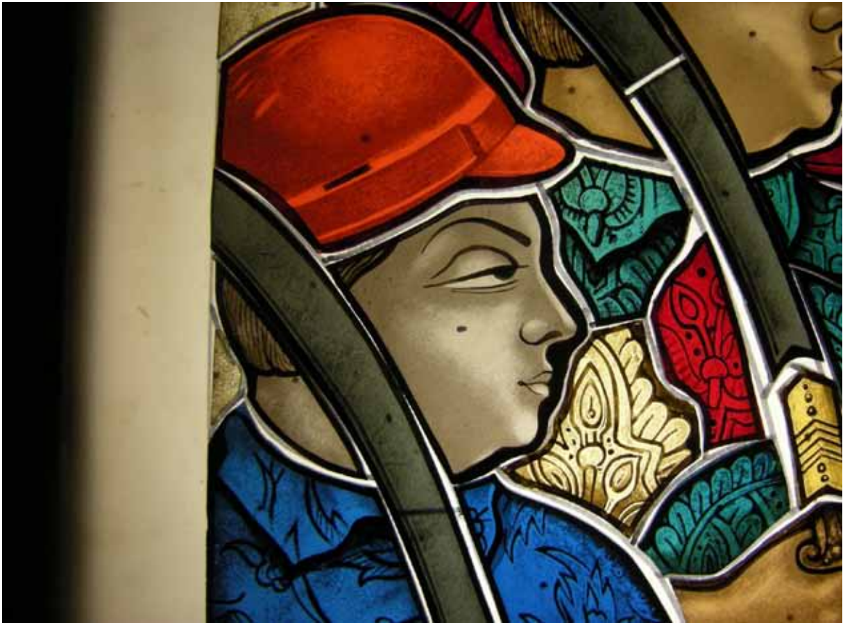
Hamra Abbas , detail of ACAP 2011 artwork

The prize has recently launched its own dedicated website: www.abraajcapitalartprize.com , which is not only the place where new artists can apply for the prize each year (the deadline for 2012 submissions is April 30 2011) and anyone interested can read the catalogue, press releases and articles, watch films and see photographs of each project – but will soon launch an interactive map which seeks to chart artistic developments across the MENASA region. Applications are also open for international curators to apply for the annual guest curator role. A new element is the introduction of a nominating system, where artists need to be proposed by leading art professionals mainly based in the region. Fresh names are welcomed, confirmed names are listed on the website and include curators such as Christine Tohme from Ashkal Alwan in Beirut, Samar Martha of Art School Palestine, November Paynter of