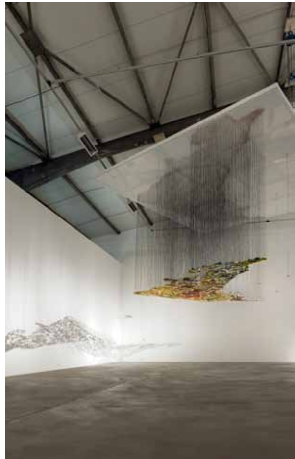
Nadia - Kaabi Link - under standing over views, 2009, collected pieces of chipped layers of paint, black silk threads, metal grid, paper clips & spotlights, Galerie Christian Hosp

Stained glass is a practice commonly used in churches