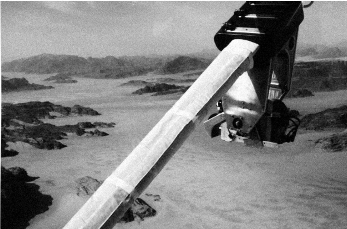
Jananne Al-Ani, location stills , Shadow Sites II, single channel digital video, photography Noski Deville

those inside the building to see the world outside or even to admit light, but rather to control it. I wish to employ this medium in projecting a narrative that has held our imagination in suspense today; a narrative that works upon themes of war, authority, beauty, and ideology. Here I have created a labyrinth of geometrical patterns, motifs, and vibrant colours to invoke the power of the image, to draw the viewer into its spatial consciousness.