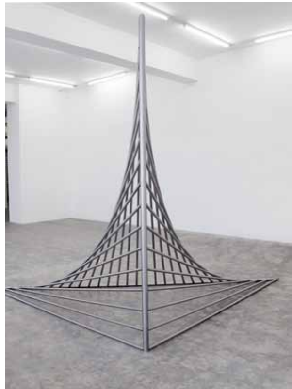
Timo Nasser, Gon, 2011, Stainless steel, 567 x 230 x 300 cm

These series of interviews have been edited and written by Laura Egerton, Curator of the Abraaj Capital Art Prize and Amy Sutcliffe, Senior Features Writer, ArtintheCity. A selection of these question and answers are available on the websites http://www.artinthecity.com and www.artdubai.ae/journal .