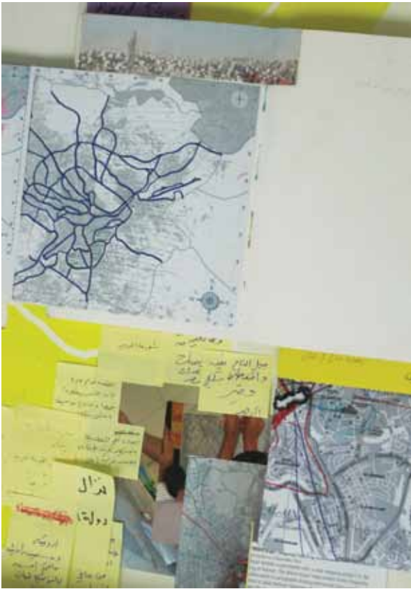
Raed Ibrahim, 'Where to go?' (detail), digital prints and map, 42 x 60 cm, 2010. Courtesy of the artist and Darat al Funun. © Photo: Ala Younis

organize the space of the city. While there are means for passage along the banks of the city, and circles in which drivers and passengers from different areas might pass one another, there remain physical and mental divisions that reinforce social ones. Just as Amman is hoped to be a city of passage for the Palestinian and Iraqi exiles, a place of transition before they can return home, it more frequently becomes a city where this future path becomes blocked. Sentences on the banks aims to highlight the possibilities of passage and connection within the urban environment, while also commenting on the durability of divisions.