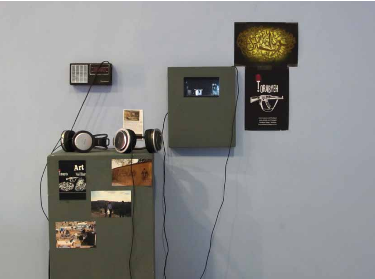
Documentation of the Torabyeh graffiti and rap workshops.