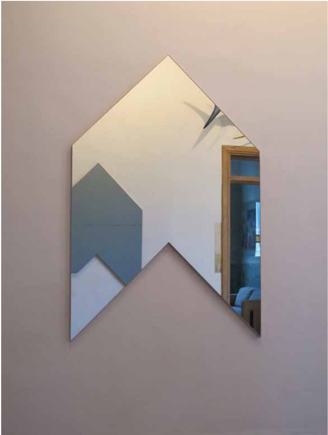
Faouzi Laatiris, Vis-à-vis, 2010, mirror, wood, two parts of 150 x 100 x 2.6 cm each. Courtesy of the artist and Darat al Funun. © Photo: Ala Younis