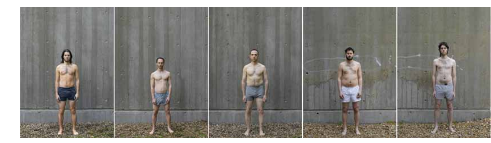
Installation of life-size images. The image of the Palestinian faces the six Israelis. That is, the work hangs on two opposite facing walls.

stake of the Shoa (the Holocaust) and then of endless wars, terrorist attacks and immense hostility from their neighbors; the others repressed and chased away from their own homes or imprisoned in unbearable situations and contexts), requires a therapy, a cure which is able to penetrate so deeply to finally reach individuals. The artist clarifies: "Any solution between Israelis and Palestinians should also involve a psychological solution. Both nations require mental healing." On the contrary, the artist's attempt is evidently to actually see the people in their bare essence: Also to be able to see himself.