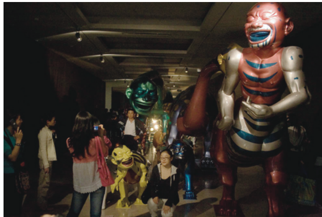
YUE MINJUN, Colorful Running Dinosaurs , 2008 Sculpture ensemble, 7th Shanghai Biennale 2008

In the legacy of the minjung movement, minjung art emerged, and in the 1980s and 1990s dominated artistic production in South Korea. The art of minjung is a politically and socially invested art practice that is aesthetically committed to Social Realism and is now often criticized for over-identification with nationalist nostalgia.