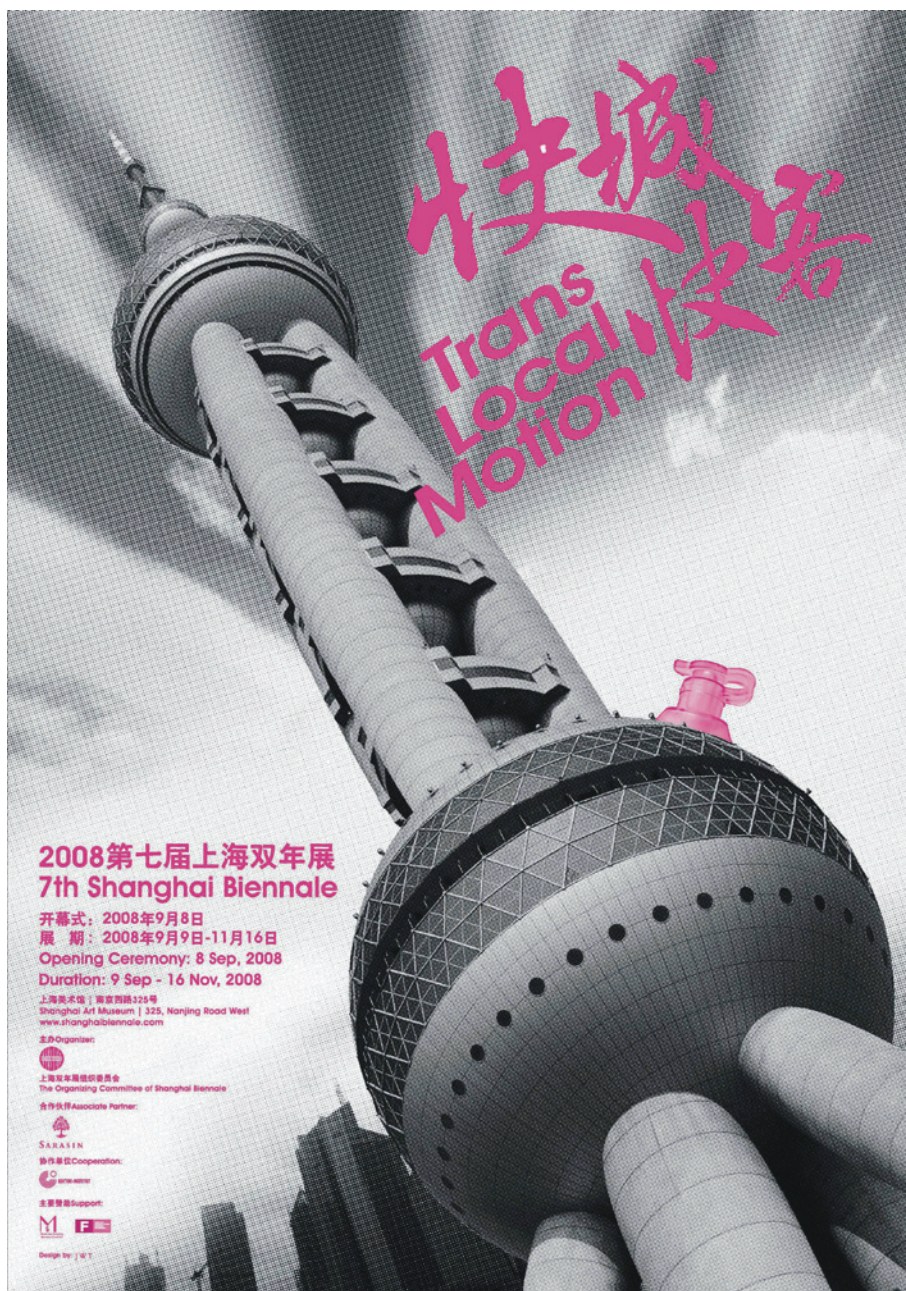
POSTER, 7th Shanghai Biennale 2008

production atelier, and training facilities for international young art professionals. However, he still defines his driving force, and the project's mission, as "discussing ideals of revo-