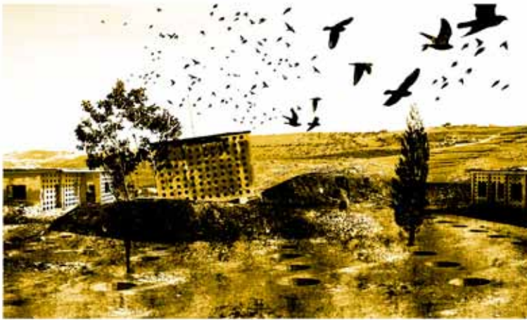
decolonizing.ps, Return to Nature, the transformation of the military base of Oush Grab (The Crow's Nest) , screenprint on paper. 60 x 95cm, Published as an edition of 30 prints by Edinburgh Printmakers, 2010

“The colonial world is a world divided into compartments. [...] Yet, if we examine closely this system of compartments, we will at least be able to reveal the lines of force it implies. This approach to the colonial world, its ordering and its geographical lay-out, will allow us to mark out the lines on which a decolonized society will be reorganized.” F. Fanon, The Wretched of the Earth