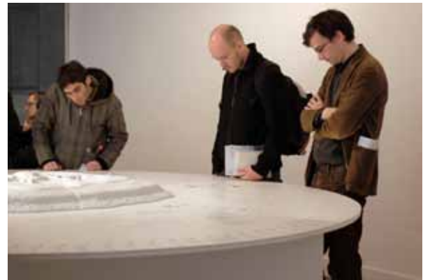
decolonizing.ps, Oush Grab model (detail), 2008, High density foam, digital print on paper, dimensions 70 x 83 x 66 cm