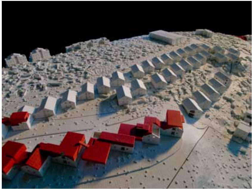
decolonizing.ps, De-parcelling, 3D model, 2008, high density foam, 3D print, 70cm x 165cm x 15cm

once unplugged from the political power that created and sustained it? The issue has not been to organize a planned, top-down reuse of the settlements, or to neutralize the destructive impulse that is associated with decolonization. As Fanon wrote, “decolonization is always a violent phenomenon”, and if occupation has been enforced through architecture, then, in the moment of decolonization, architecture must burn. Eliminating those architectures, nevertheless, could not be the solution to the problem, but, as it happened in Gaza, could rather bring enormous logistical, ecological and political problems. The “disengagement plan” left behind tons of toxic rubble that irremediably damaged Gaza aquifers. Therefore; what DA has been trying to do is to offer a lexicon of spatial interventions, a laboratory to think through and experiment with various ways in which people, after an instinctive moment of re-appropriation and destruction, could start dealing with those affected sites.