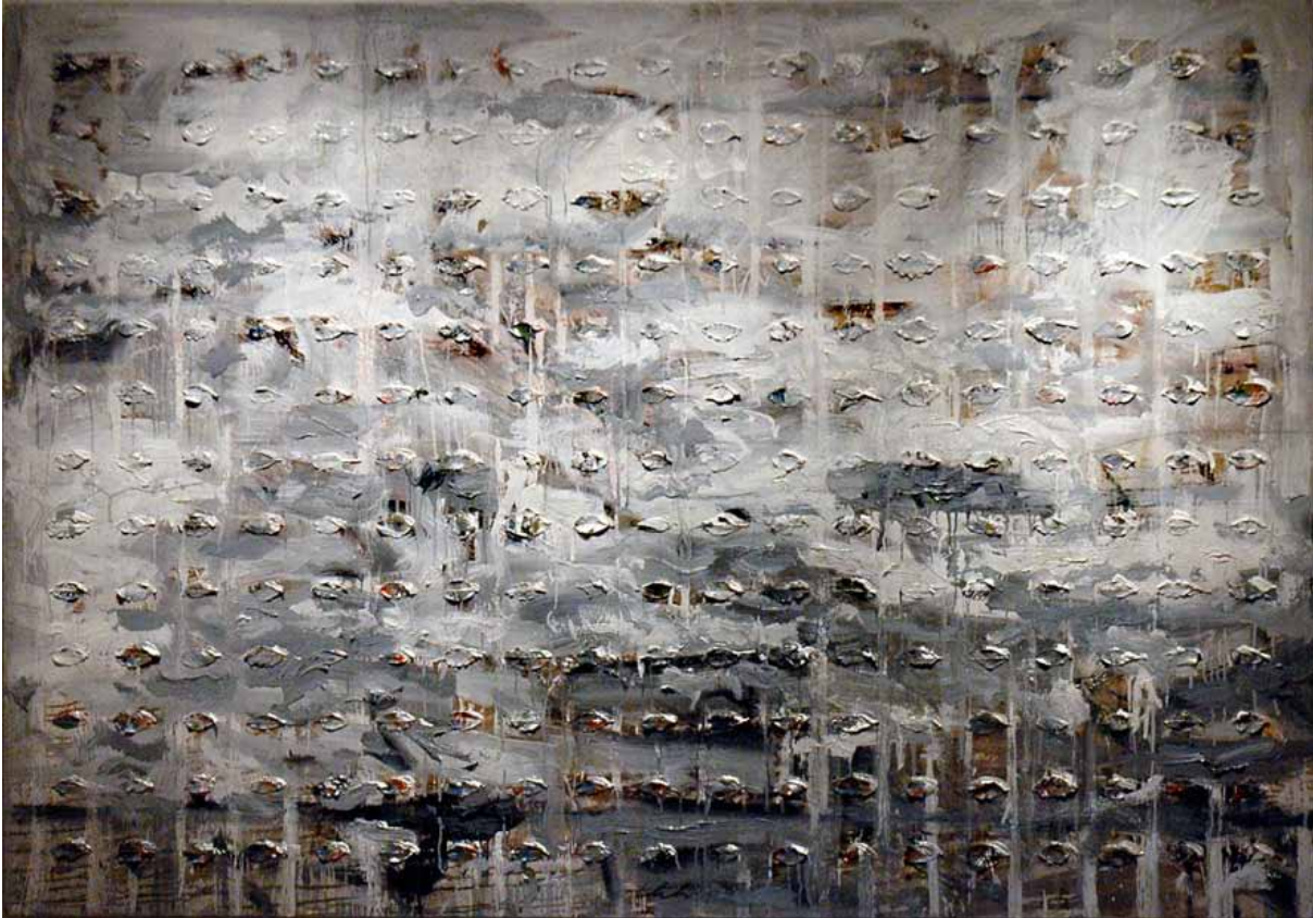
TH74 Thaier HELAL «Untitled» - 140 X 200 cm. Mixed Media on Canvas 2009

Abstraction in its purest, non-representational form exists as a rigorous set of variables, a formalism that rejects the details of a corporeal reality, that which would otherwise call for the employment of illusion in the depiction of a specific subject matter. What the purist sense of abstraction allows for is the suggestion of something that lies outside of the physically tangible, occupying another realm altogether, be it amidst a state of consciousness or deep within the subconscious. Abstraction in art can be found in virtually every visual culture in various capacities, from the bark cloth of Tonga to Persian miniature painting and everything in between. In the Arab world, much of the basic principles of abstraction have been drawn from the rich tradition