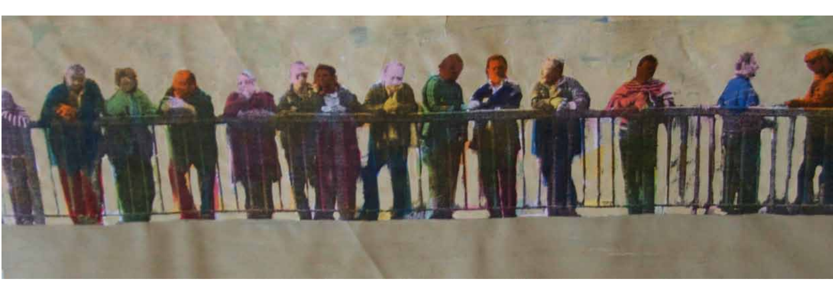
BACK COVER-On the Bridge, Oil on Paper, 100x35cm, 2011.