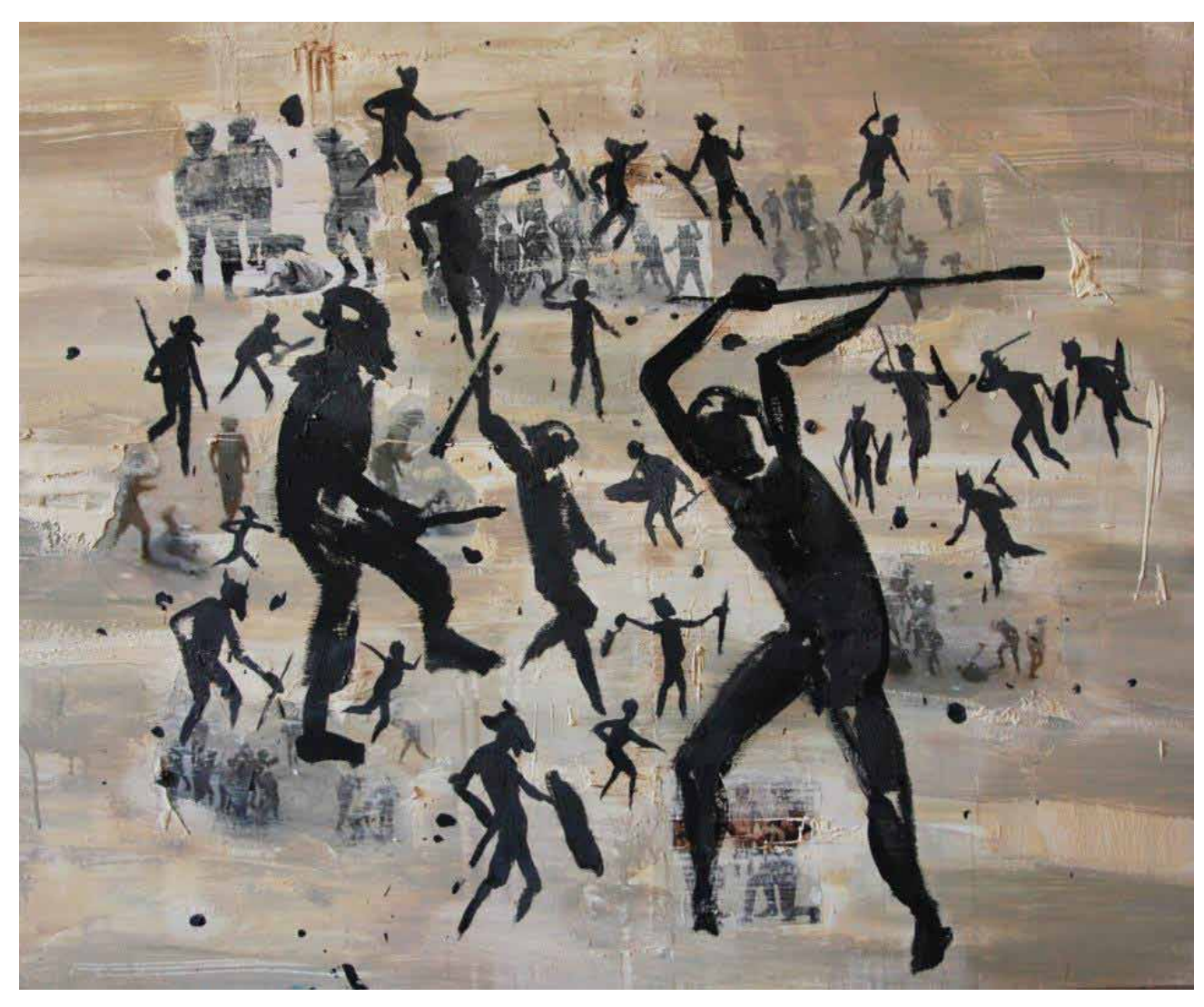
Wolves 2, 2012, acrylic on canvas, 100x70cm