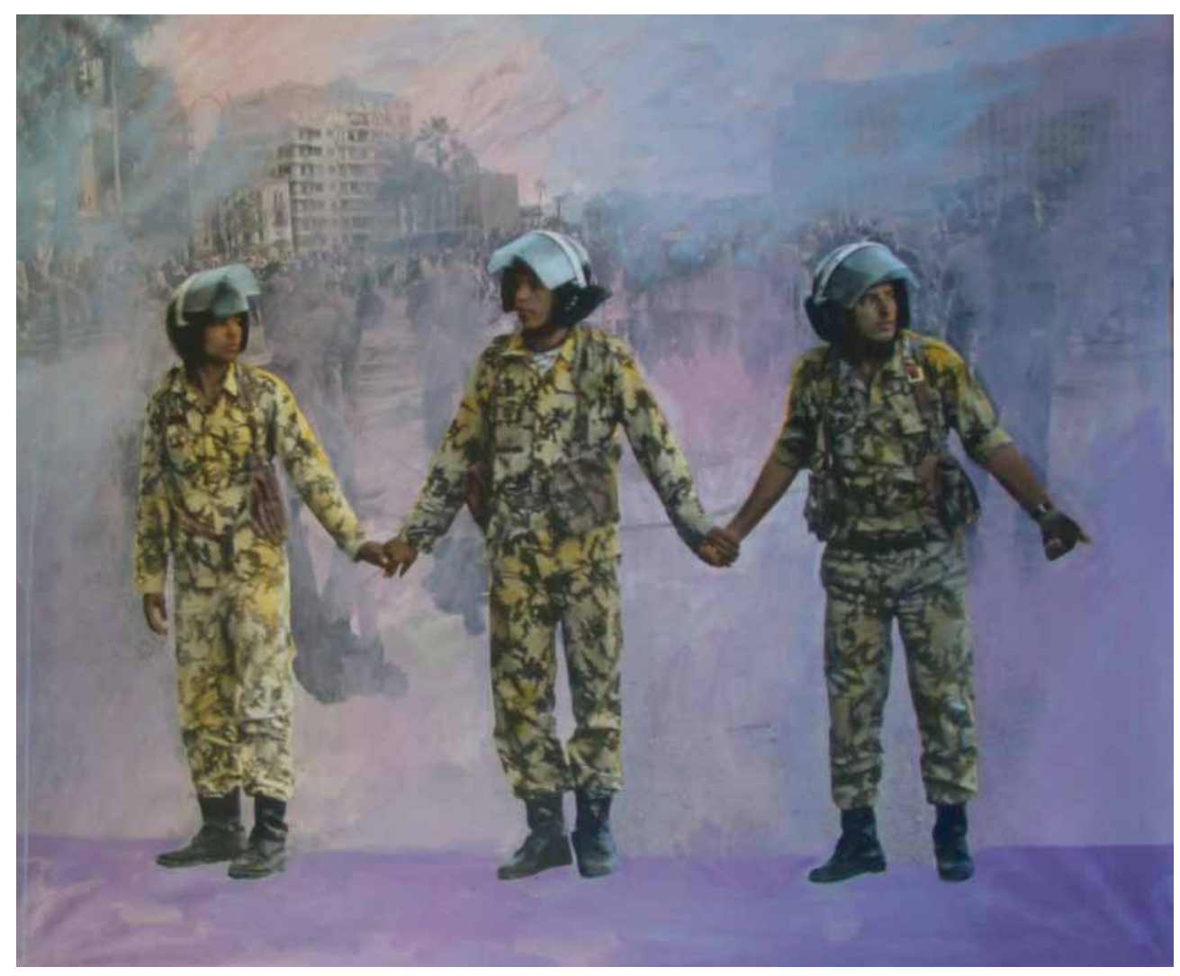
Hand in Hand, 2012, acrylic on canvas, 140x160cm

felt nostalgic towards family of the 1940's; I would draw a father, mother, maybe two or three children hoping to catch that moment of togetherness, the father wears a fez, and has his arm wrapped around his child. The mother embraces another girl, with matching pink bow and socks, while the youngest of child her children is standing gazing at nothingness. "But the family changes and people separate to establish their own families. I look at relatives, neighbors. Eventually I see more people and my big family: Egypt. I play with words and meanings and look at all the changes that are happening in the family, how it grew and how Egypt has been changing. After 25 January 2011, I started observing