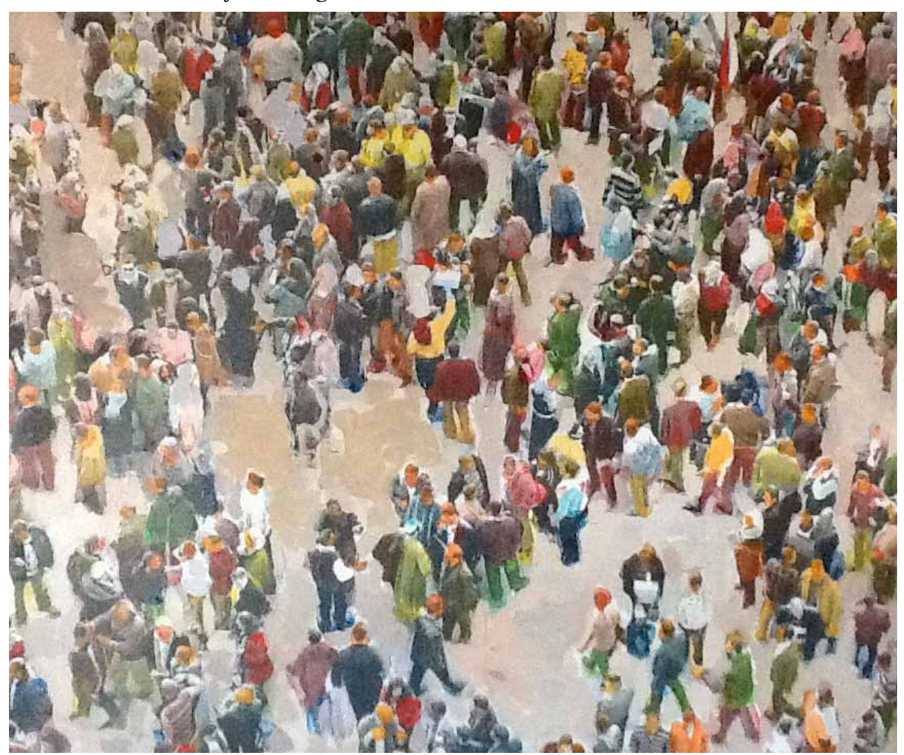
The Crwod, 2012, acrylic on canvas, 120x120cm

By Ati Metwaly First Published in "Majalla" Magazine in 2011