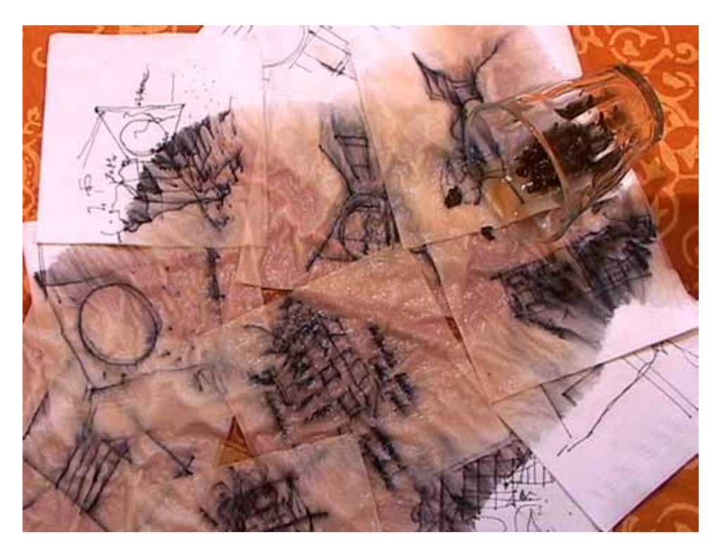
9,409 miles, Video Still, 2009