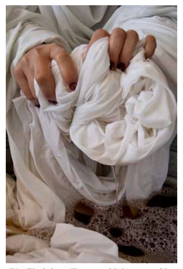
«This will be the last--» (The quote and dashes are part of the title), C-Print, 20x30» (50.8x76.2 cm), 2009

In the act of preparing the bride, the women have partaken in continuing patriarchy and enmeshing, very much like a captured fish, in the veils and traditions of marriage, not only for the young girl, but the family as well. Samizay's circle of matriarchs leave the young bride on the burgundy Afghan