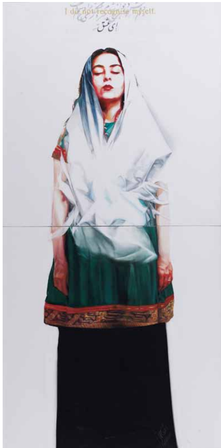
Detail of Rapture , 2009, Oil on Canvas, 200x100 cm