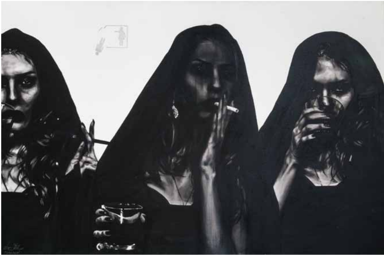
Untitled' 2012, Oil on Canvas 2012, 100x150cm - Courtesy of Ayyam Gallery.

dark, inner personality. Head tilted slightly upwards, she inhales her cigarette in defiant denial of her pain. She retains a great strength, stubbornly assured in her convictions and the dismissal of her lover, glaring out of the corner of her eyes, willful revenge plagues her every thought. This harshness of attitude is offset by the delicate earring scintillating in the light; a juxtaposition to reflect her once soft femininity and further enforce the idea that great beauty is capable of inflicting great misery. This basic instinctual desire for revenge represents the id. The figure on the left is bathed in light. Staring directly at the viewer, she sits exposed with her loneliness and pain on view for all to see, even if she wills it to disappear. In an almost rationalizing manner, she holds a lit cigarette between her fingers and raises the glass to her lips. Clear-eyed and aware, this figure constitutes the super-ego, that part of the psyche that plays a critical and moralizing role. With