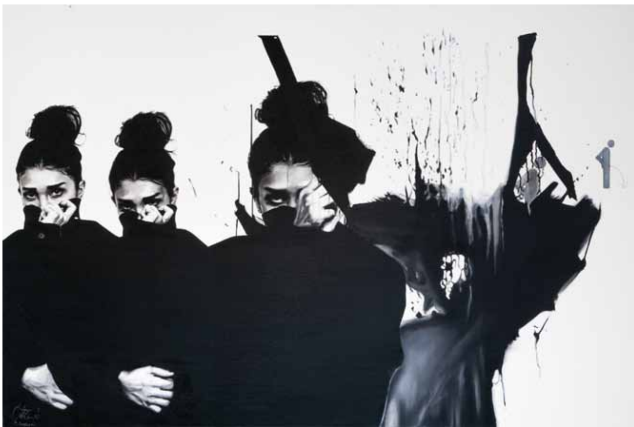
The First-timer , 2012, Oil on canvas, 100x150cm.