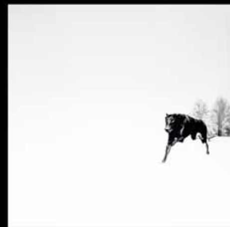
Lonely, 2012, Oil on canvas, 100x300cm.