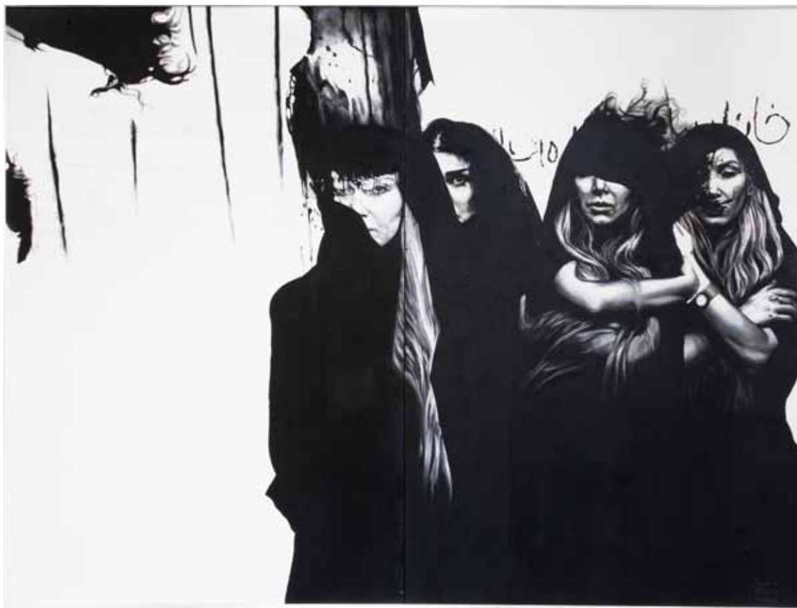
Repent' 2012, Oil on Canvas 2012, 100x150cm.