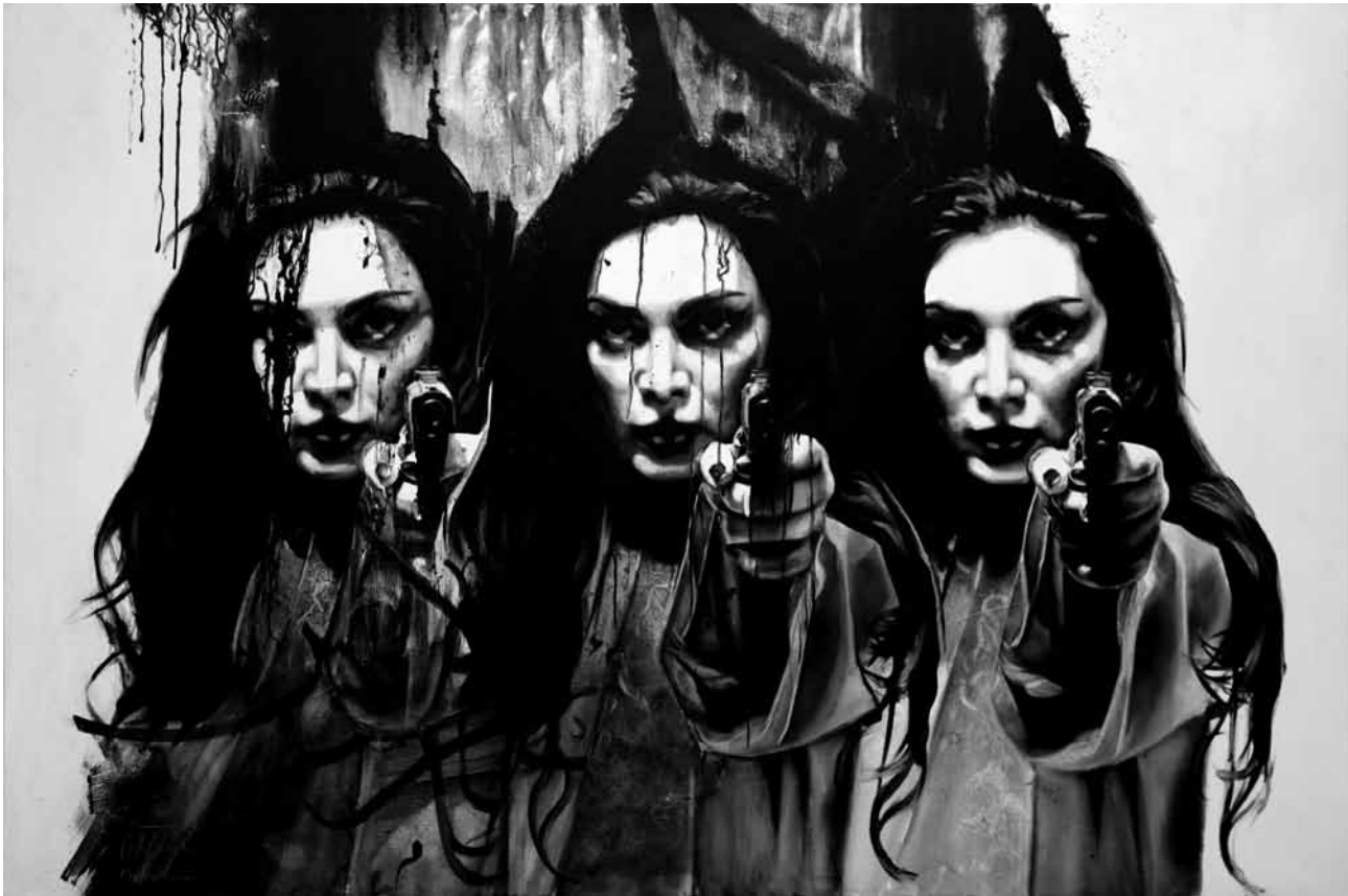
Join Now , 2012, Oil on Canvas, 100x150cm - Courtesy of Ayyam Gallery.