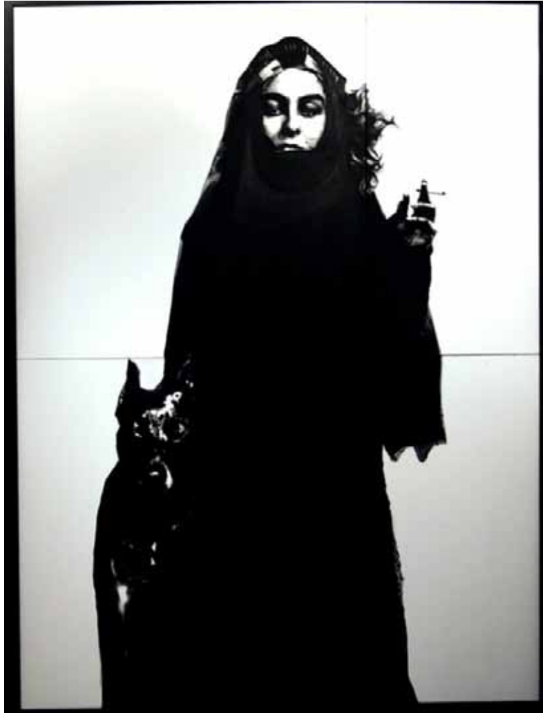
Untitled, 2006, Oil on canvas, 200 x150cm