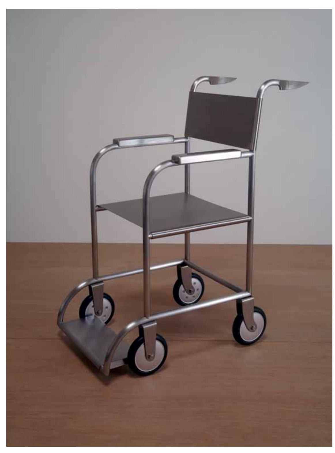
Figure 4. Mona Hatoum, Untitled (wheelchair), stainless steel and rubber, 97.2 x 49.3 x 82.7 cm, 1998.