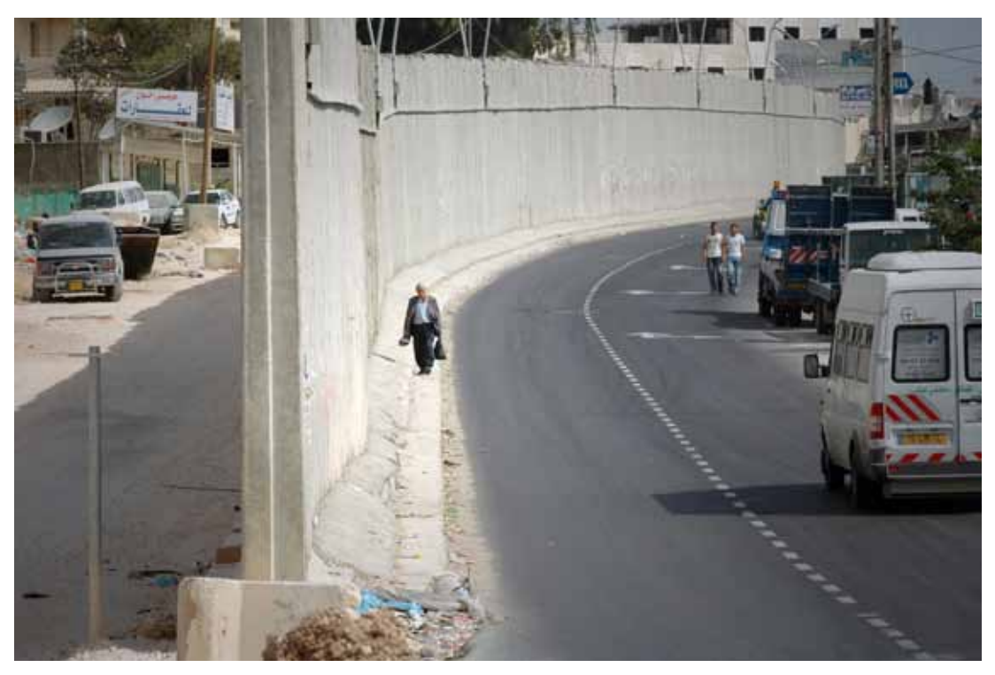
Figure 7. The eight-meter Separation Wall built by Israel cuts the heart of East Jerusalem.