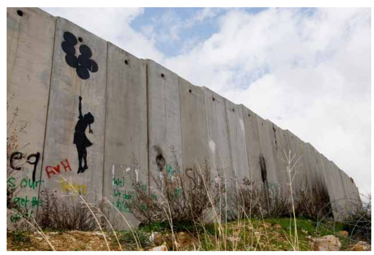
Figure 1. The painting of the flying girl with the balloons (2005) on the Separation Wall at Qalandia checkpoint is the work of Banksy.

seems more thematic rather than ethnic-oriented. What Palestine is going through has enticed many artists of different nationalities to align themselves with the Palestinian experience. The land of Palestine has extended its known geographical boundaries and any artist, regardless of his or her nationality, can live on this virtual land and create. Hence, excluding the work of these artists from curatorial shows has, in many ways, become a sort of self-appropriation when curated by Palestinians and a sort of basic ignorance when curated by non-Palestinians. This has led, according to Darwish, to the creation of a form of indigenous or ethnic Palestinian art that weakens Palestinian art when exhibited in a group, especially because people approach it from a purely political or ethnic perspective.31 What Banksy has painted on the Separation Wall (figure 1) cannot be excluded from Palestinian art history books, and the same applies to Karkoutly.