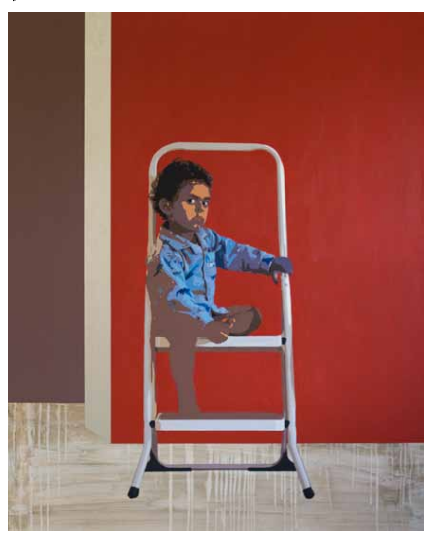
Figure 9. Hani Zurob, A flying lesson #03, Acrylic and oil color on canvas, 200x160cm, 2010 There is a distinctive shift in the style of Zurob's art since he left Palestine in 2006.

This thesis was submitted in conformity with the requirements for the Master's Degree in Art Business Sotheby's Institute of Art in London / University of Manchester – 2009.