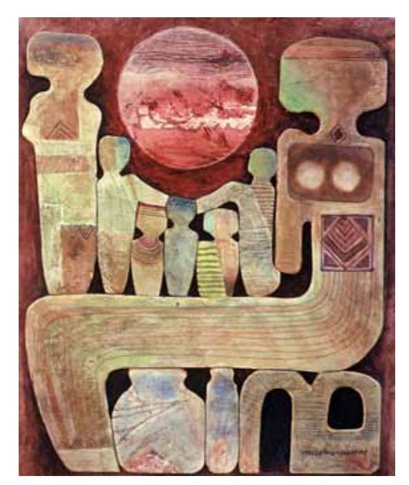
Figure 3. Nabil Anani, Summer Evening # 251, leather on wood, 1992