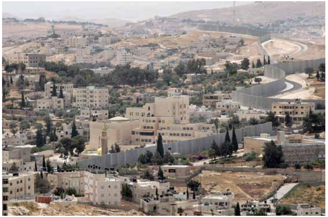
Figure 8. The Separation Wall zigzags around neighborhoods in East Jerusalem, and separates Palestinians from other Palestinians. This has restricted the mobility of Palestinians to move in their own city and prevents West Bank Palestinians from reaching Jerusalem.