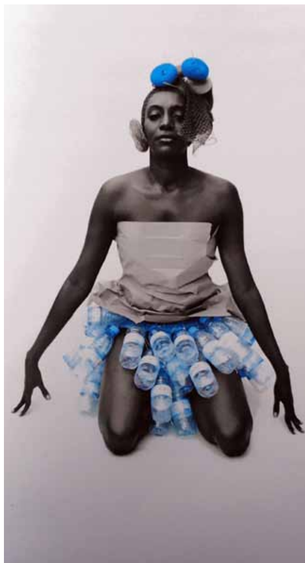
Pan-African Exhibition , Omar Victor Diop from Senegal. Series Fashion 2112, 2011. The National Museum of Mali.

Born in 1935, Malick Sidibé, who received special honors during the 9th Biennial, is considered to be one of the most important, world renowned,