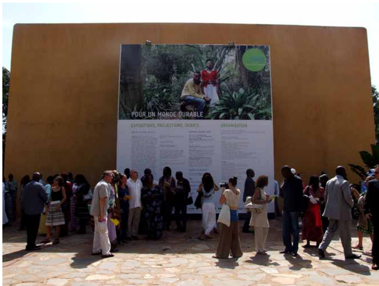
Side wall of the National Museum of Mali with the attendees of the opening ceremony of Bamako Encounters.

important form of historical documentation on Malian social history.