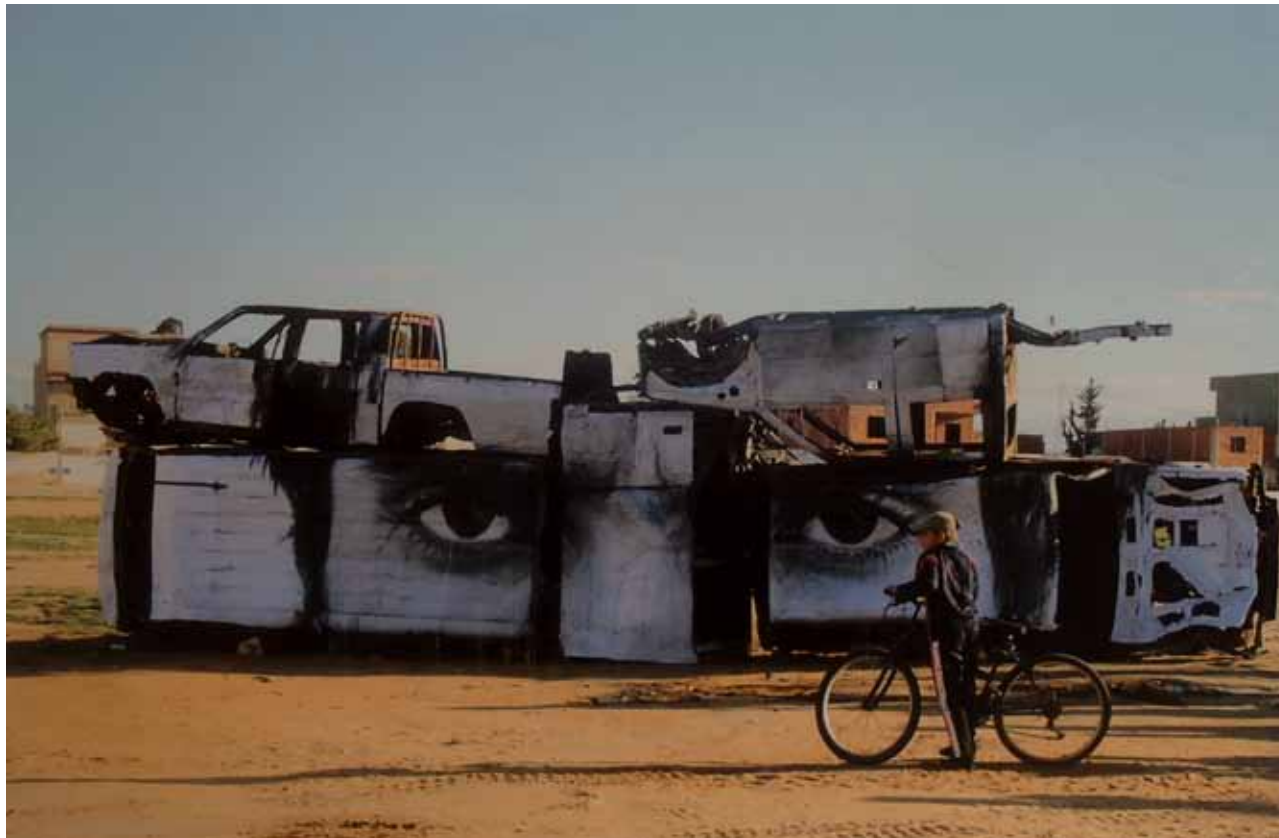
The Arab Spring exhibition , photo from Artocratie (Artocracy), part of the Inside Out project by JR held in Tunisia.