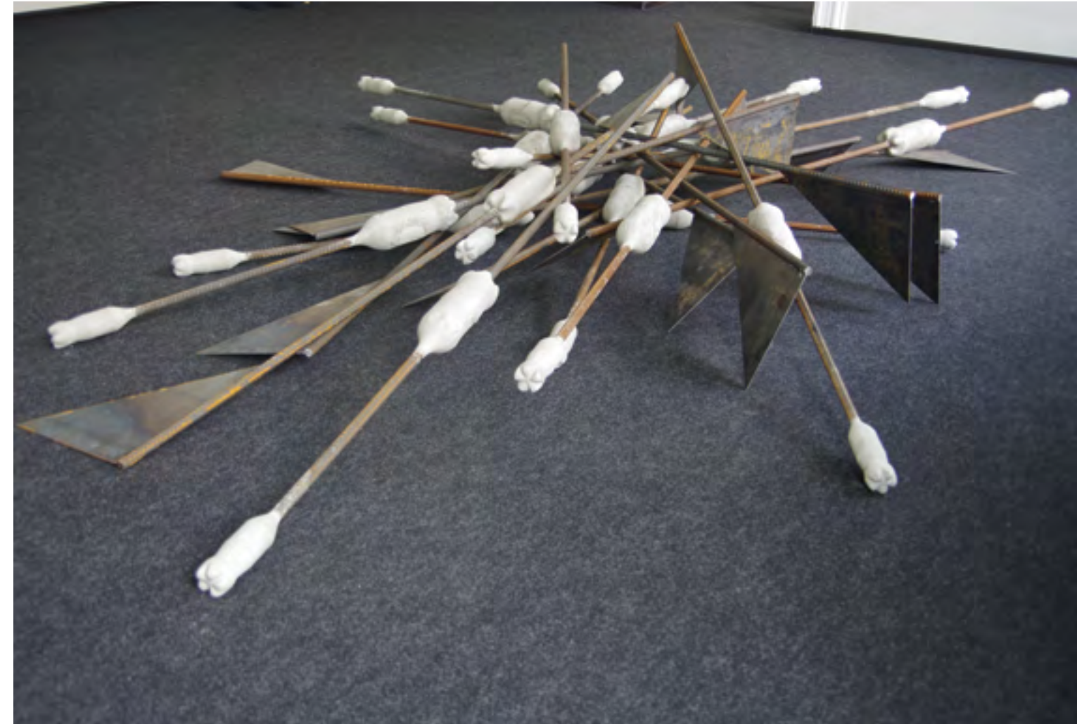
Johannes Voql, Bodenboje/around bouyaqe, 2013, concrete, steel plates of 20 pieces, 250x32x12 cm.

xxxxx xxxxx xxxxx xxxxx xxxxx xxxxx xxxxx xxxxx xxxxx xxxxx xxxxx xxxxx xxxxx xxxxx xxxxx xxxxx xxxxx xxxxx