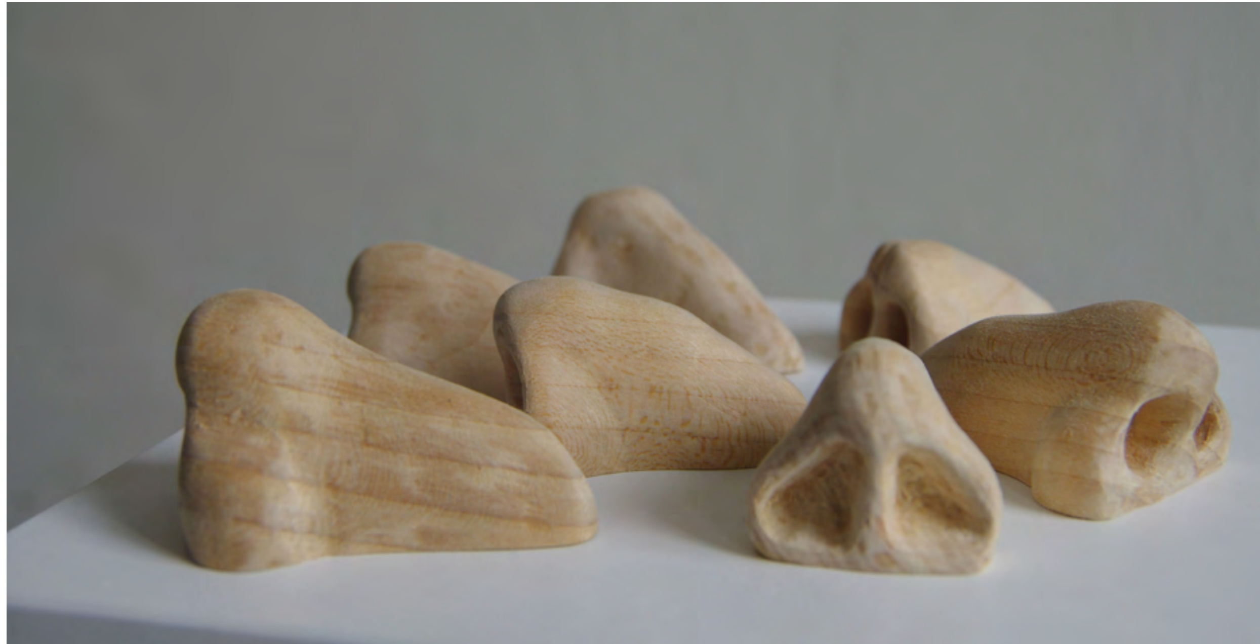
Taus makhacheva, Landscape, 2013 ongoing, Wood, variable dimensions.